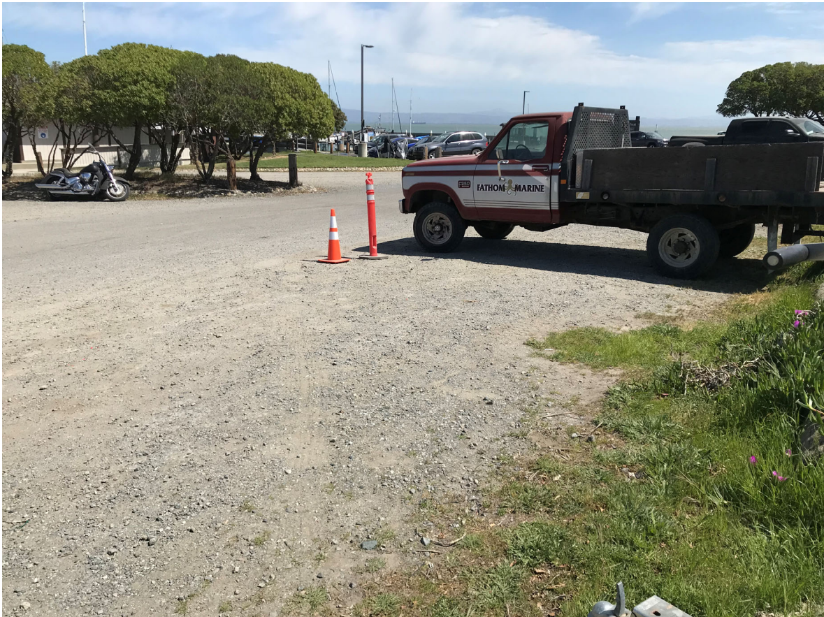
65 – View of Lower Parking lot gravel and degraded asphalt surfaces