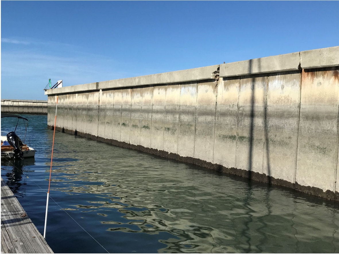
46 – View of seawall