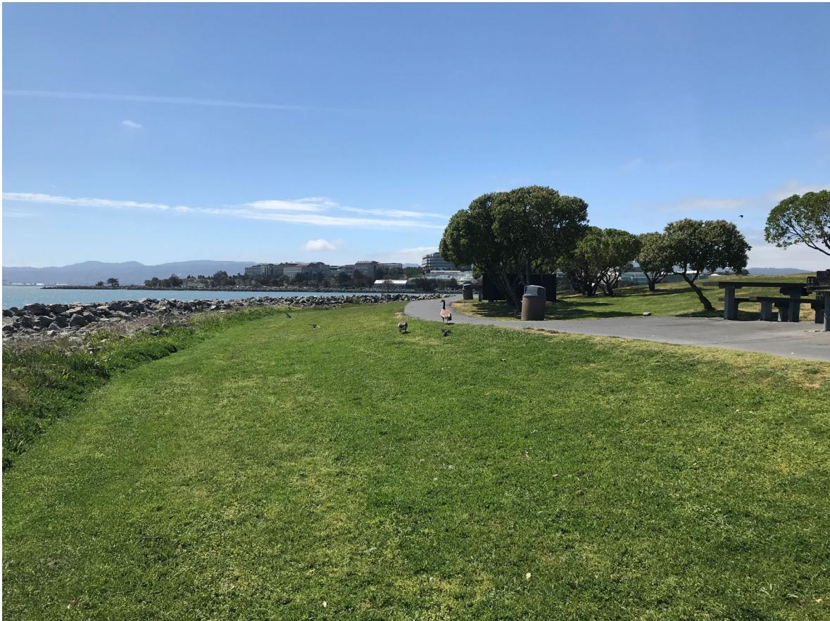
75 – View of Bay Trail along southeast corner of peninsula