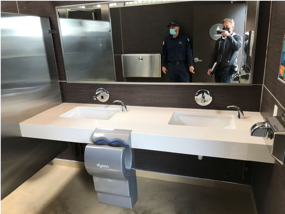
60 – View of Restroom 2 interior