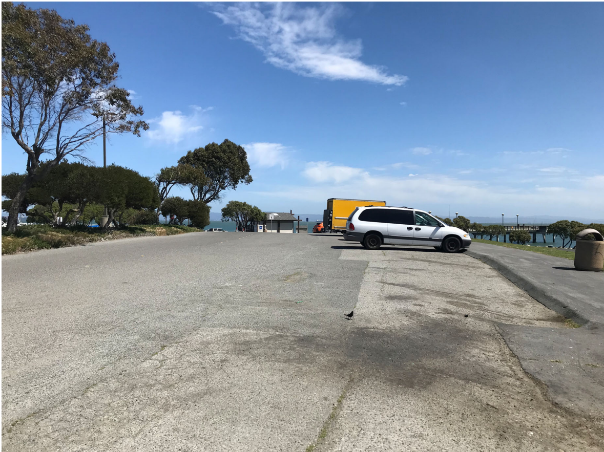
67 – View of Marina Boulevard looking east