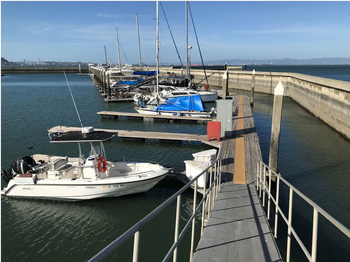
43 – View of East Basin Dock 14