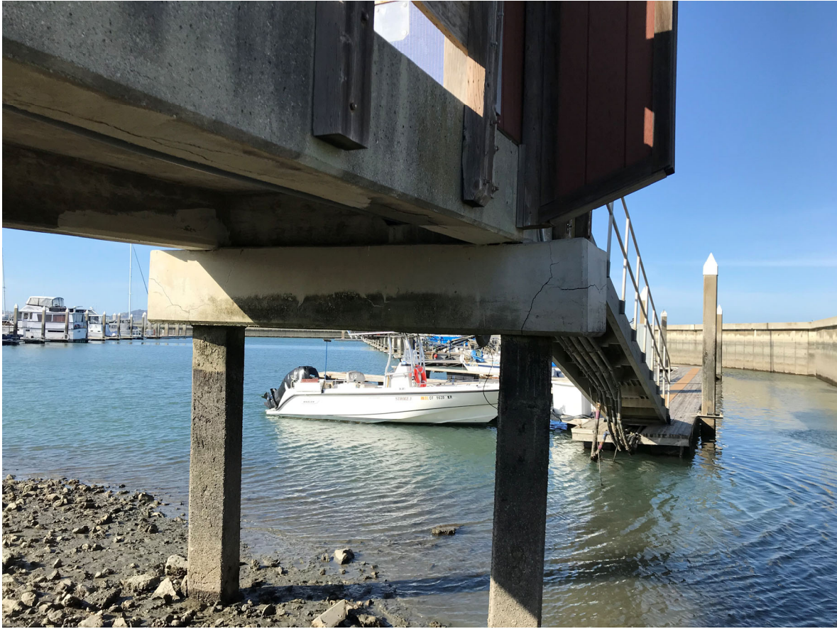
44 – View of East Basin dock 14 gangway platform cracked concrete bent