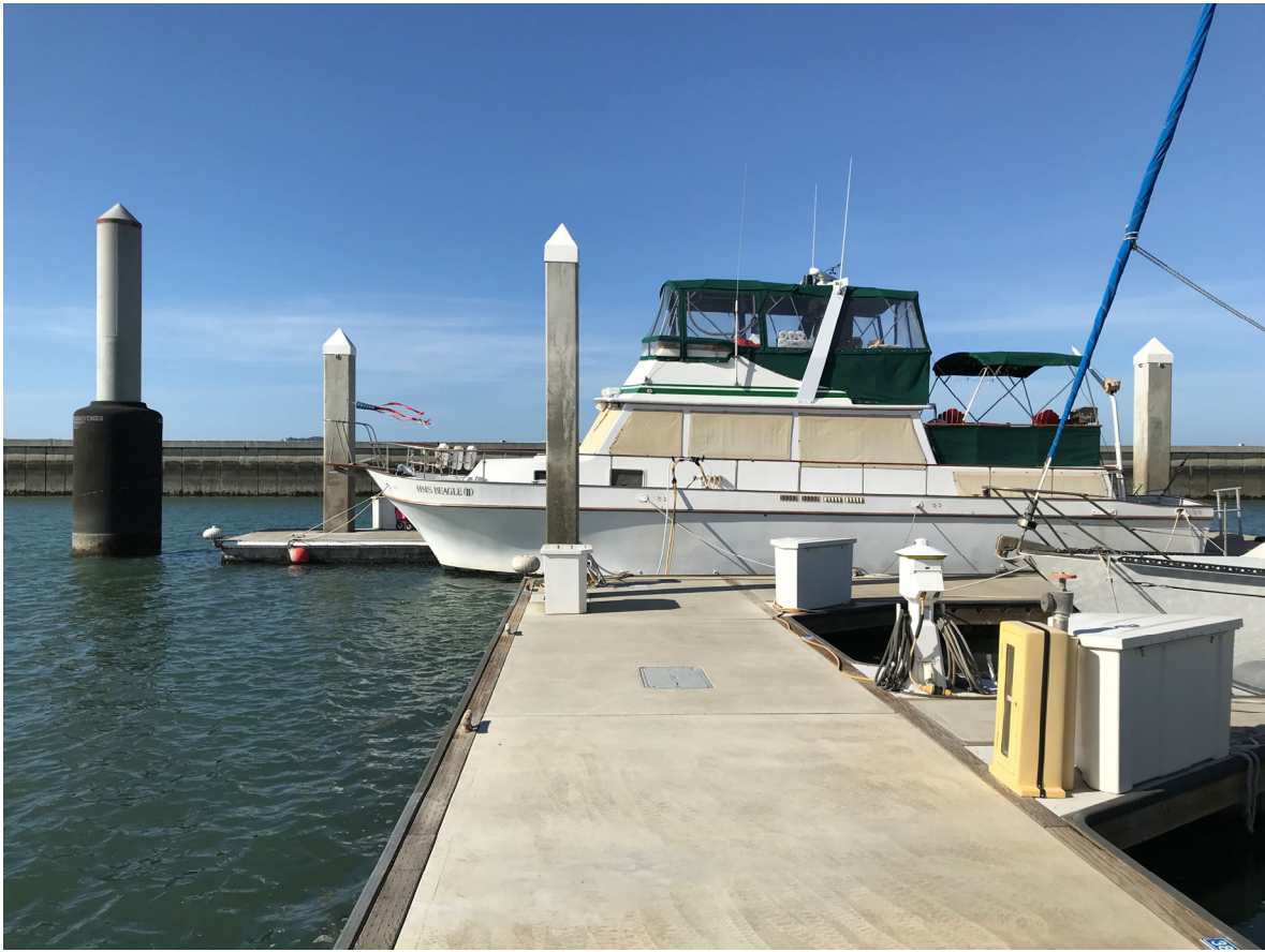
30 – View of end of Dock 11