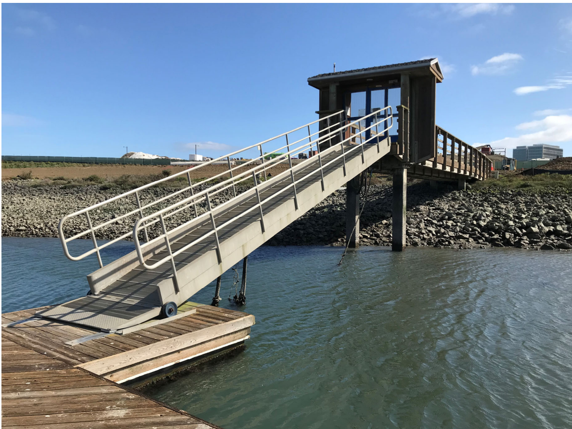
3 – View of West Basin Docks 1 and 2 Gangway Platform