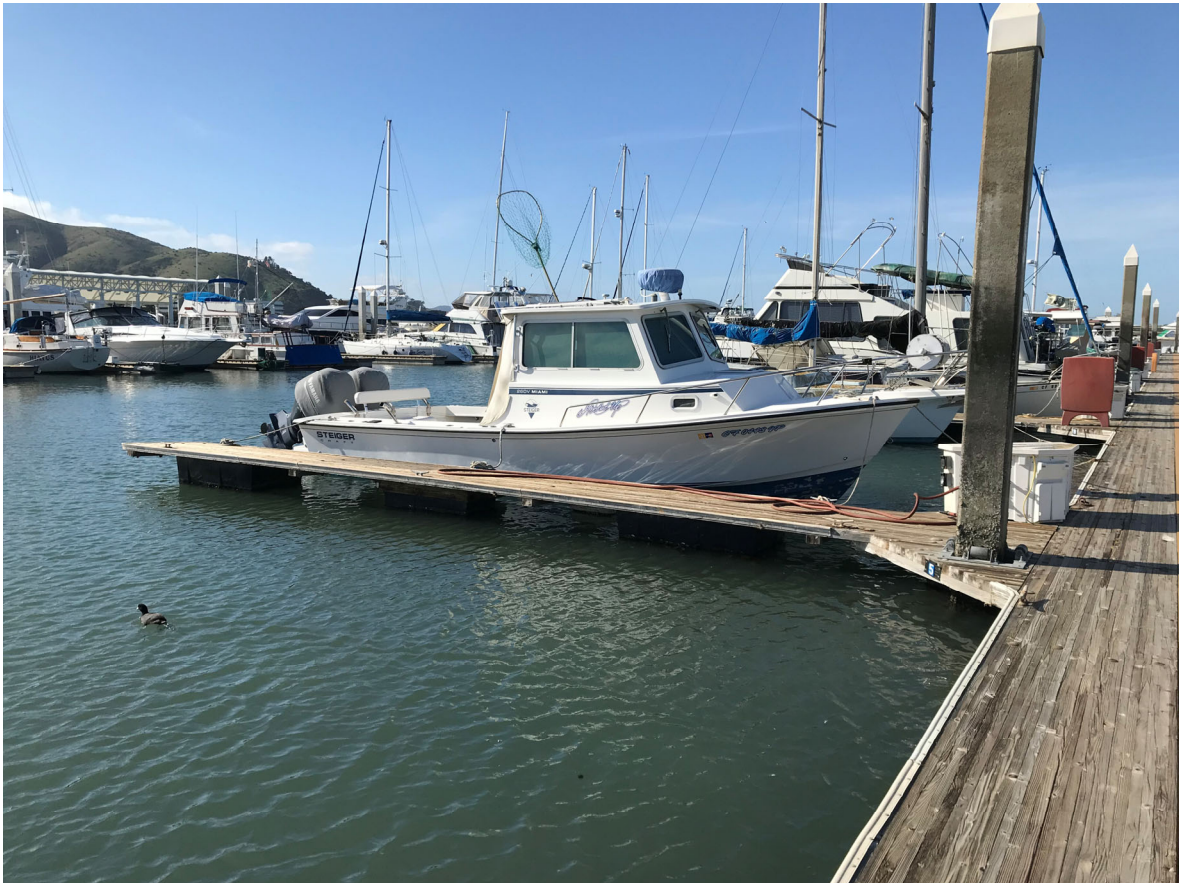
37 – View of East Basin Dock 12 finger