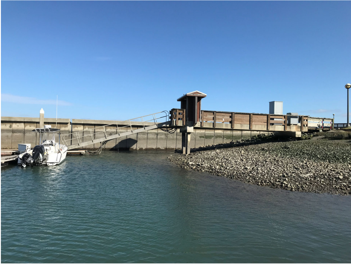
42 – View of East Basin Dock 14 gangway platform