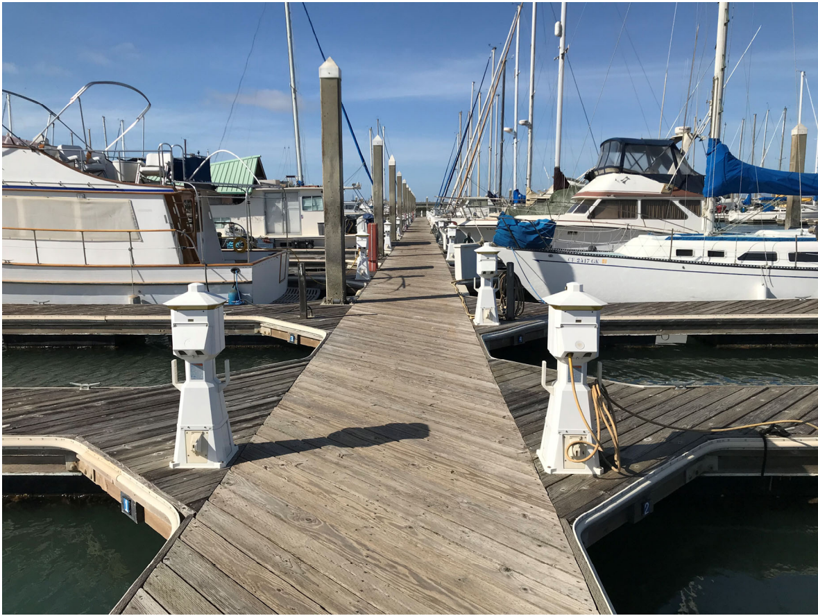
20 – View of West Basin Dock 5