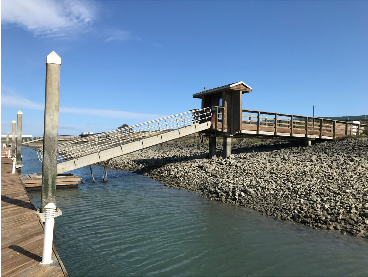
10 – View of West Basin Docks 3 and 4 Gangway Platform