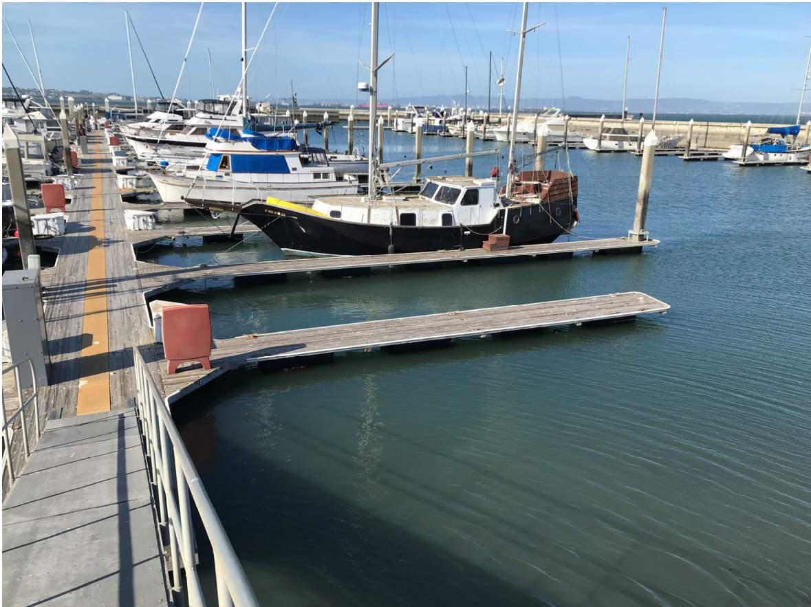
41 – View of East Basin Dock 13