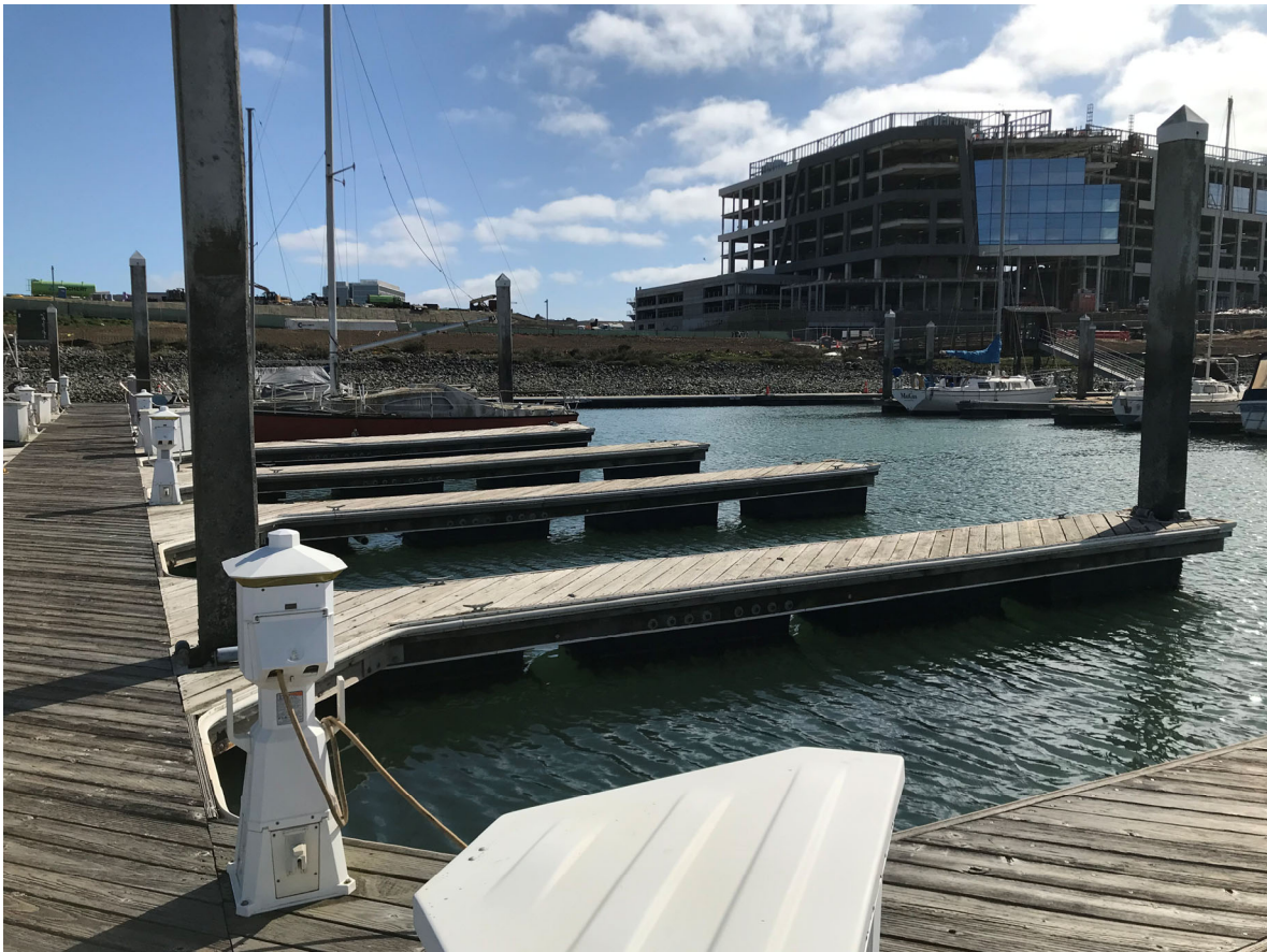
13 – View of West Basin Dock 3