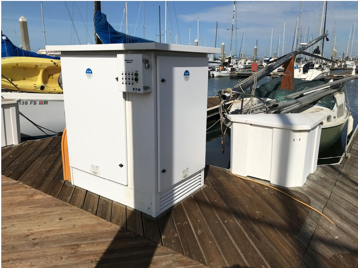
7 – View of West Basin Dock 2 transformer