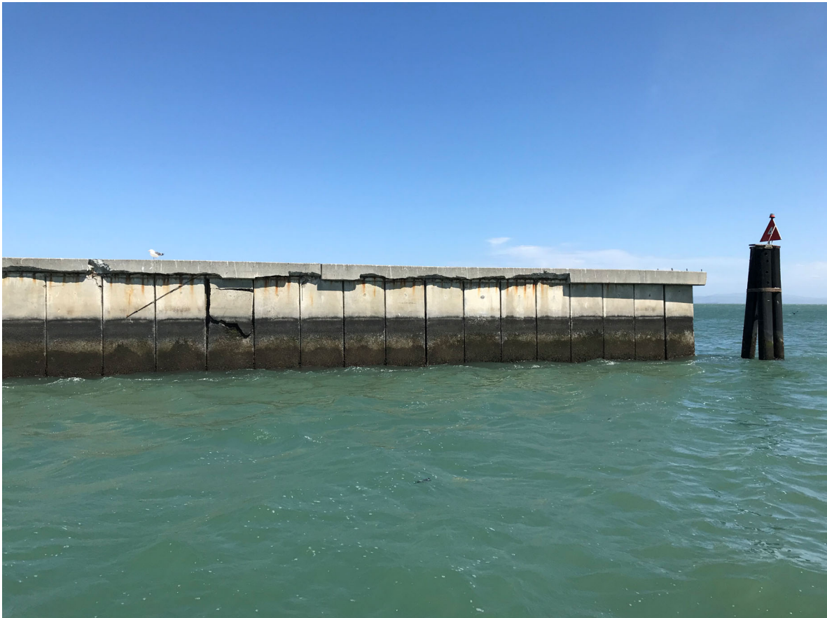
47 – View of damaged seawall cap