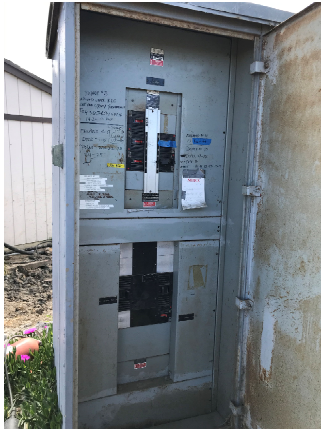
73 – View of inside of main site electrical enclosure panels