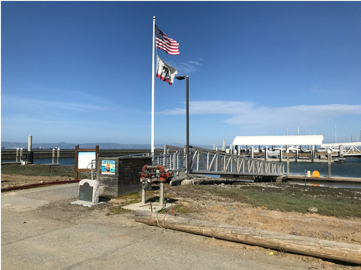
25 – View of Guest Dock ADA gangway