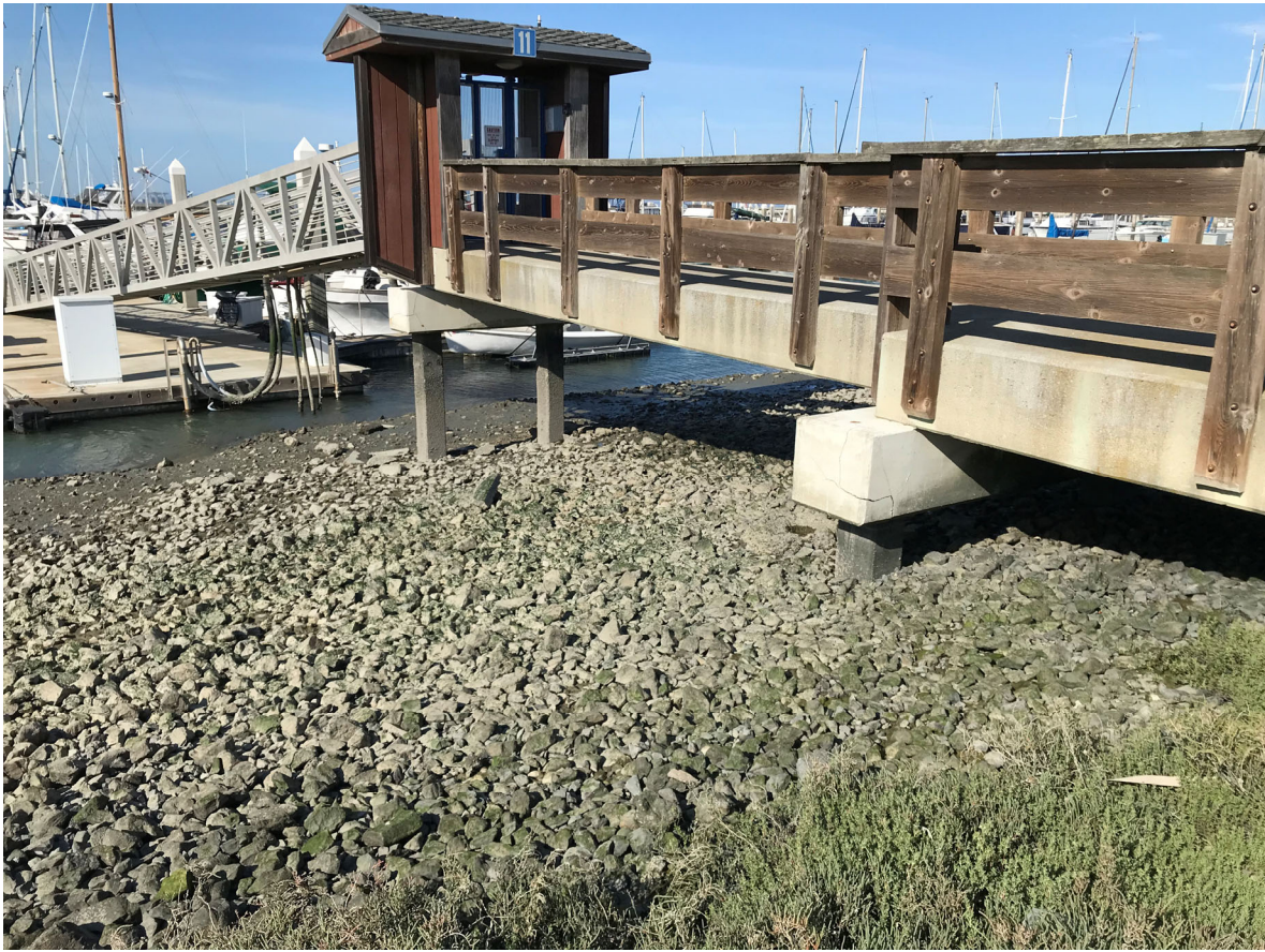
28 – View of Dock 11 gangway platform and ADA gangway