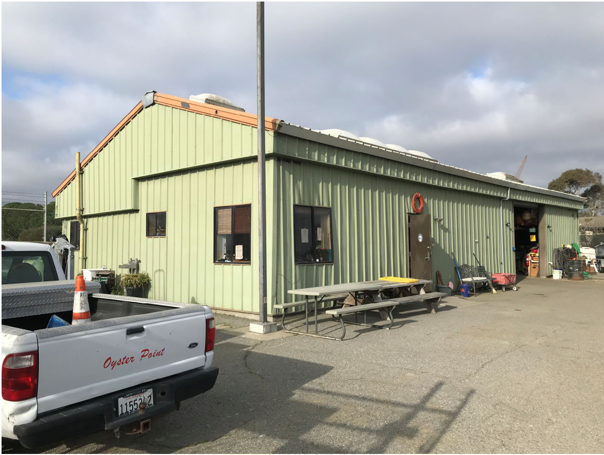
50 – View of Maintenance Building