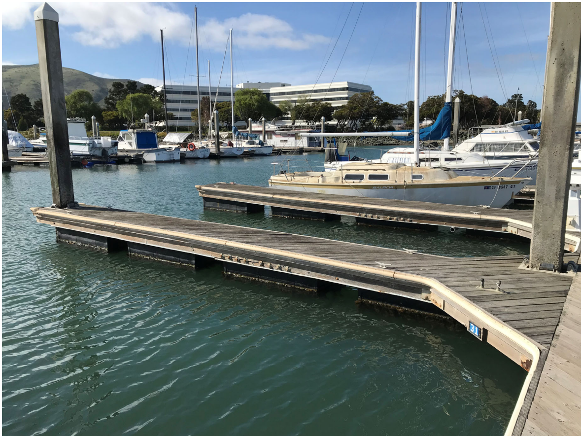
17 – View of West Basin Dock 4 fingers