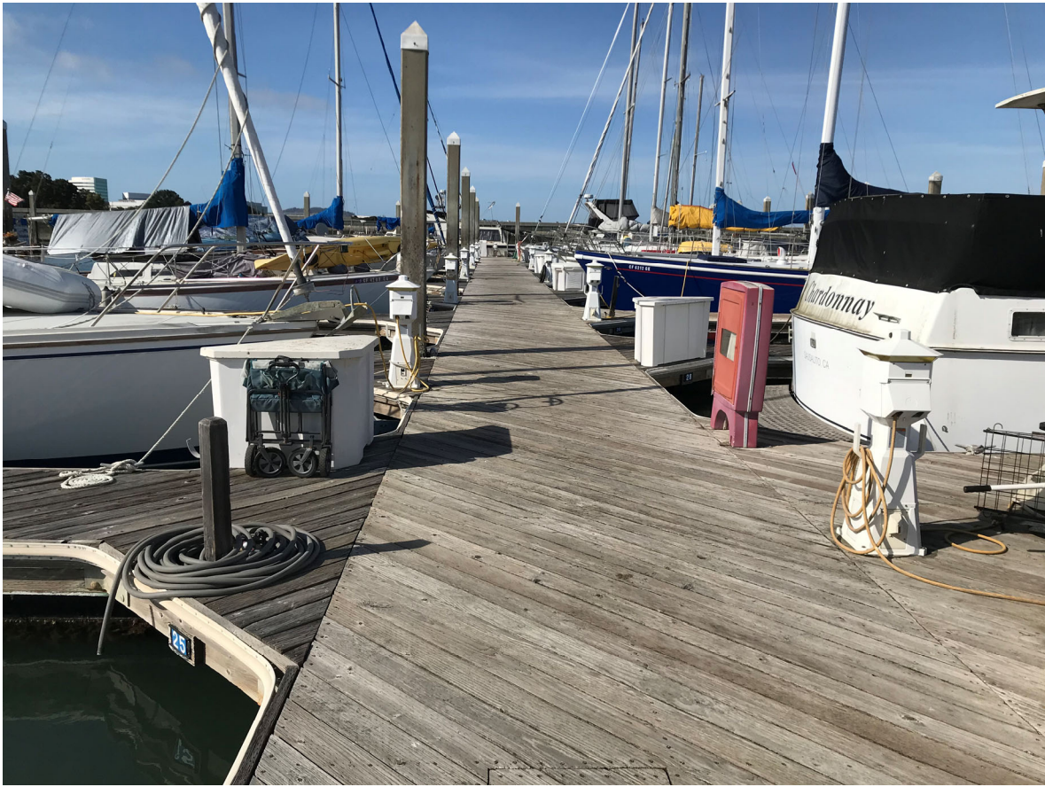
22 – View of West basin Dock 6