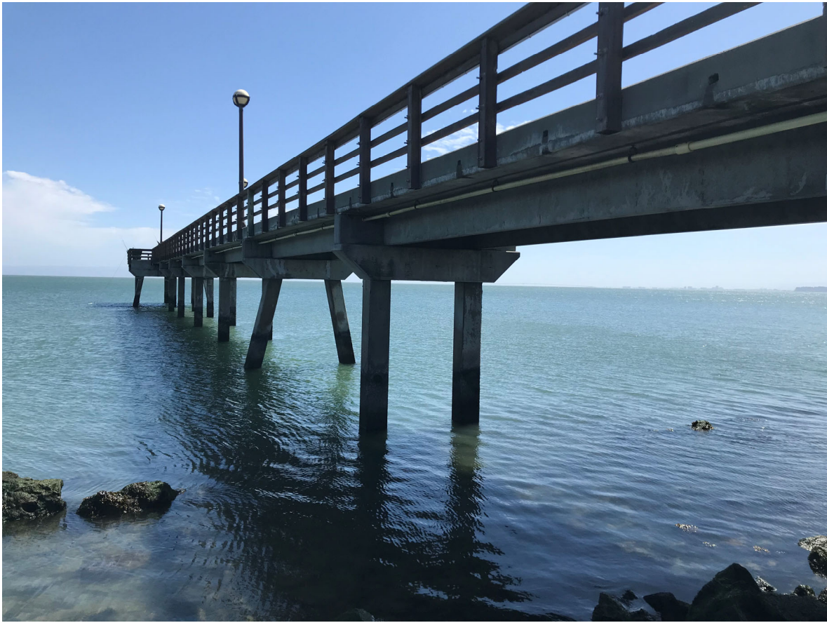
80 – View of Public Fishing Pier