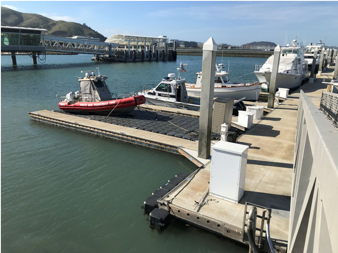
29 – View of ferry terminal and Dock 11