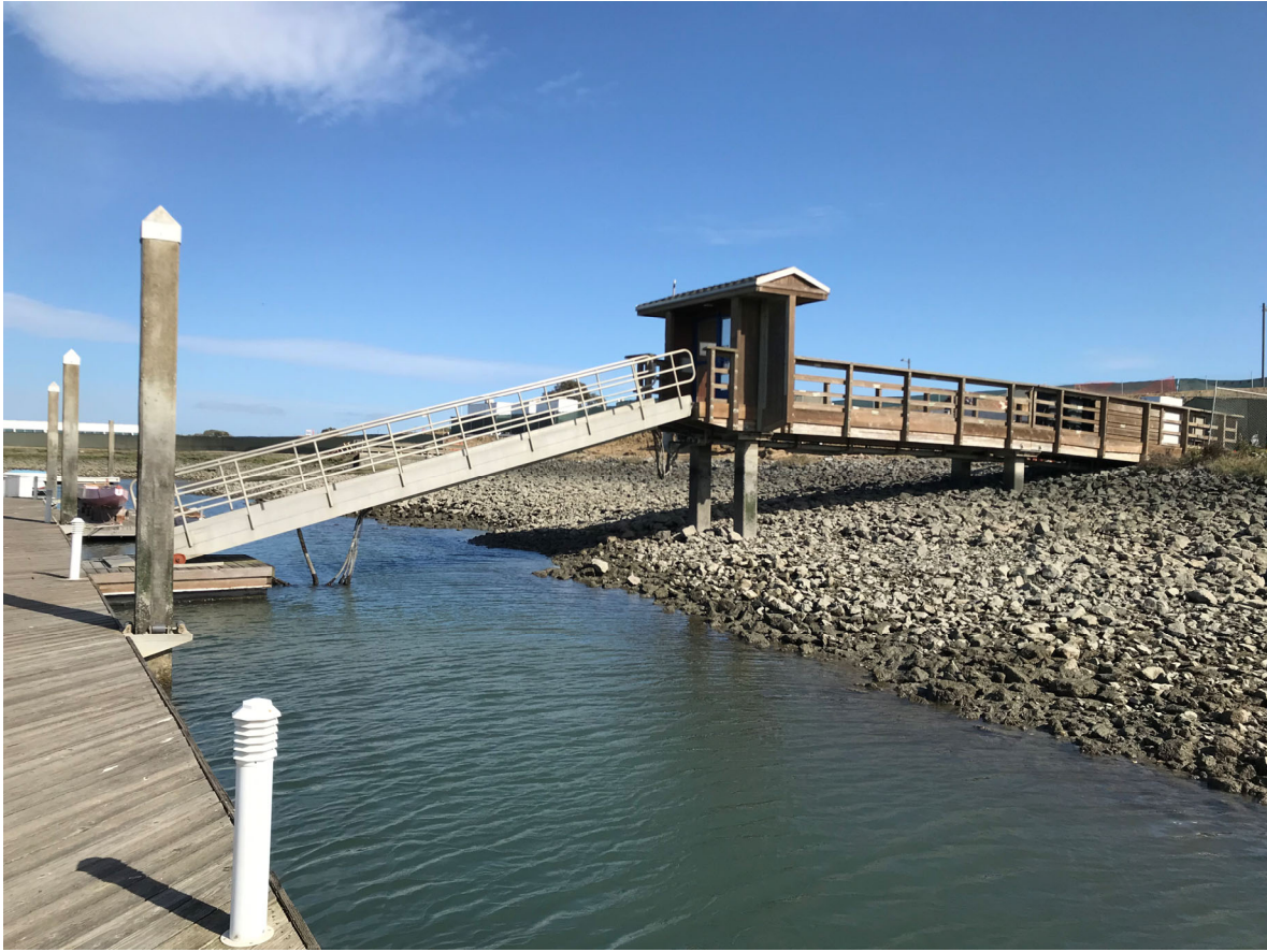
18 – View of West Basin Docks 5 and 6 Gangway Platform