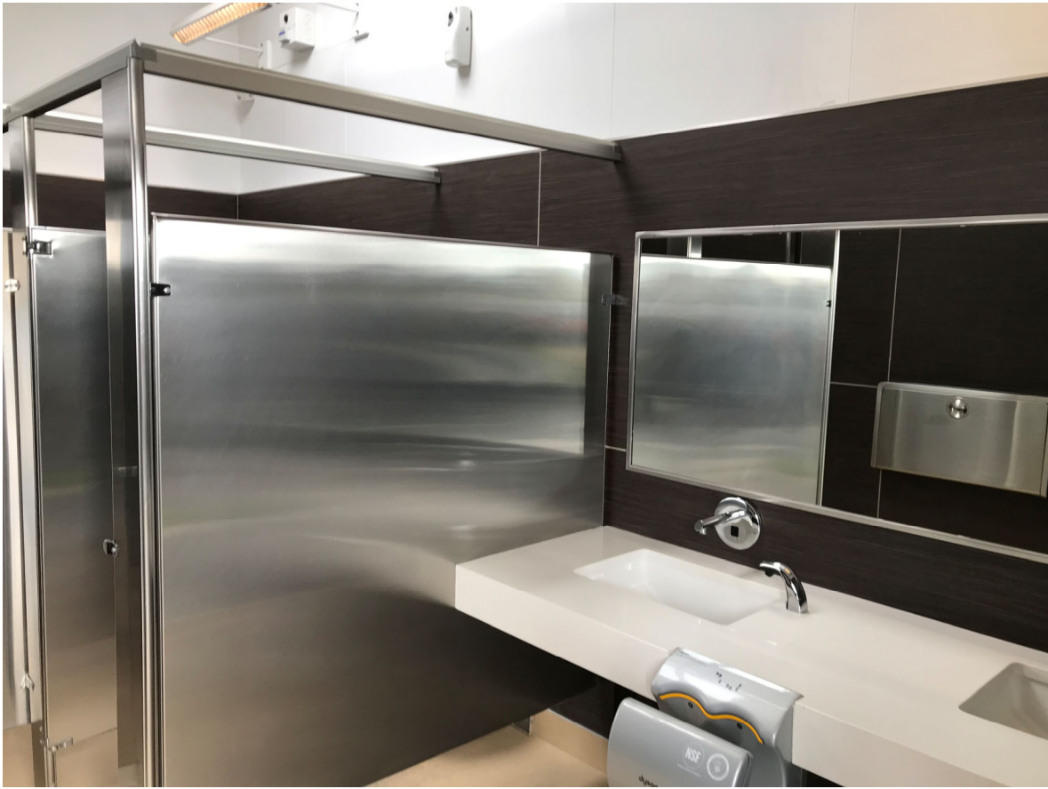
62 – View of East Basin Restroom 3 interior