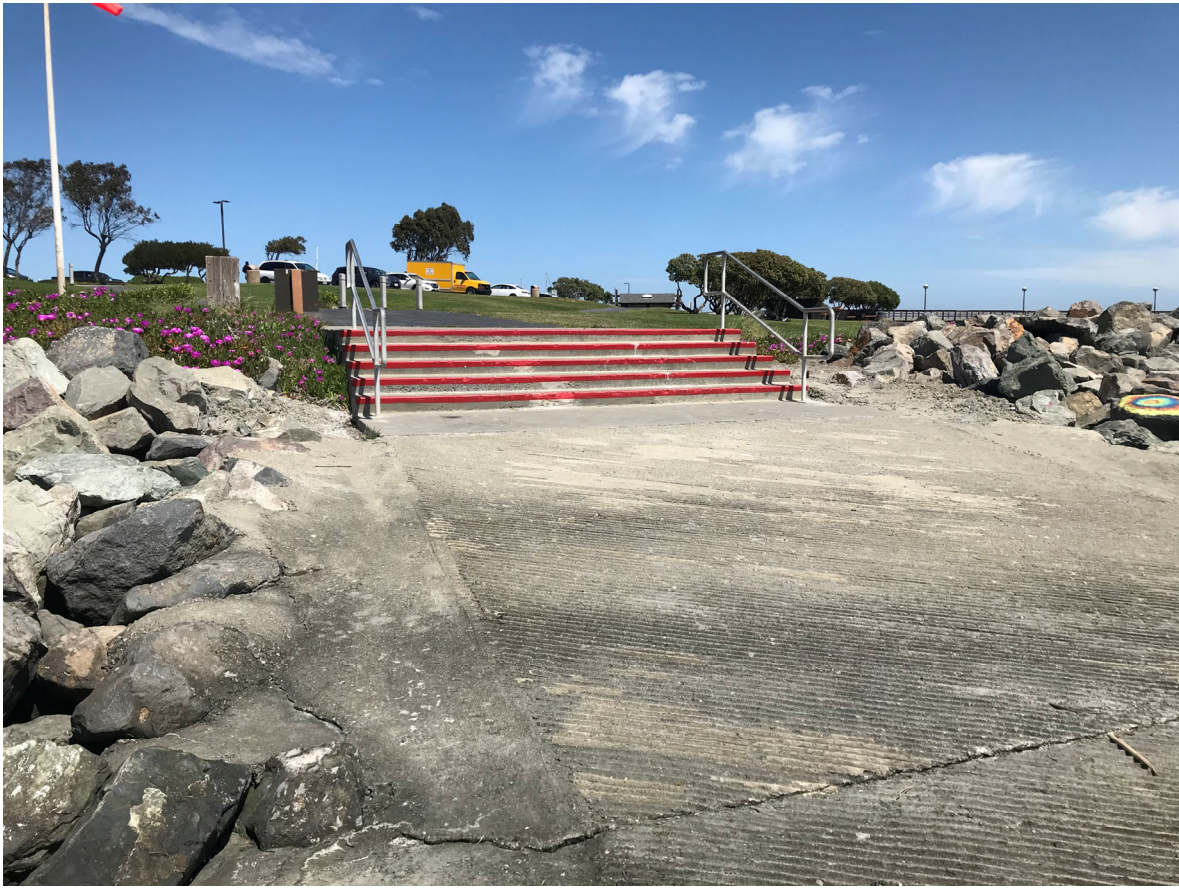
76 – View of Windsurfer launch area