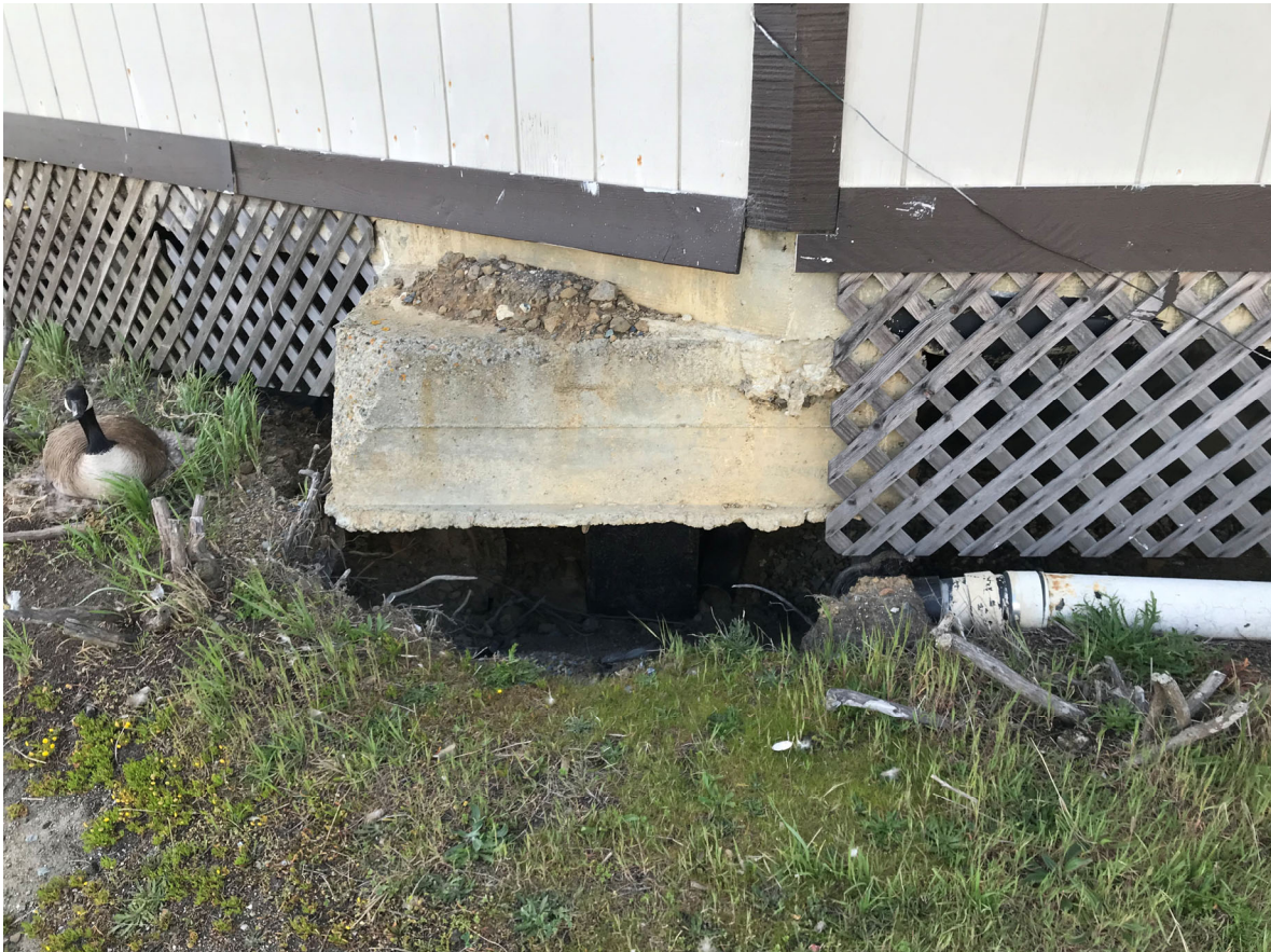
49 – View of undermining of Harbormaster's Office Building foundation