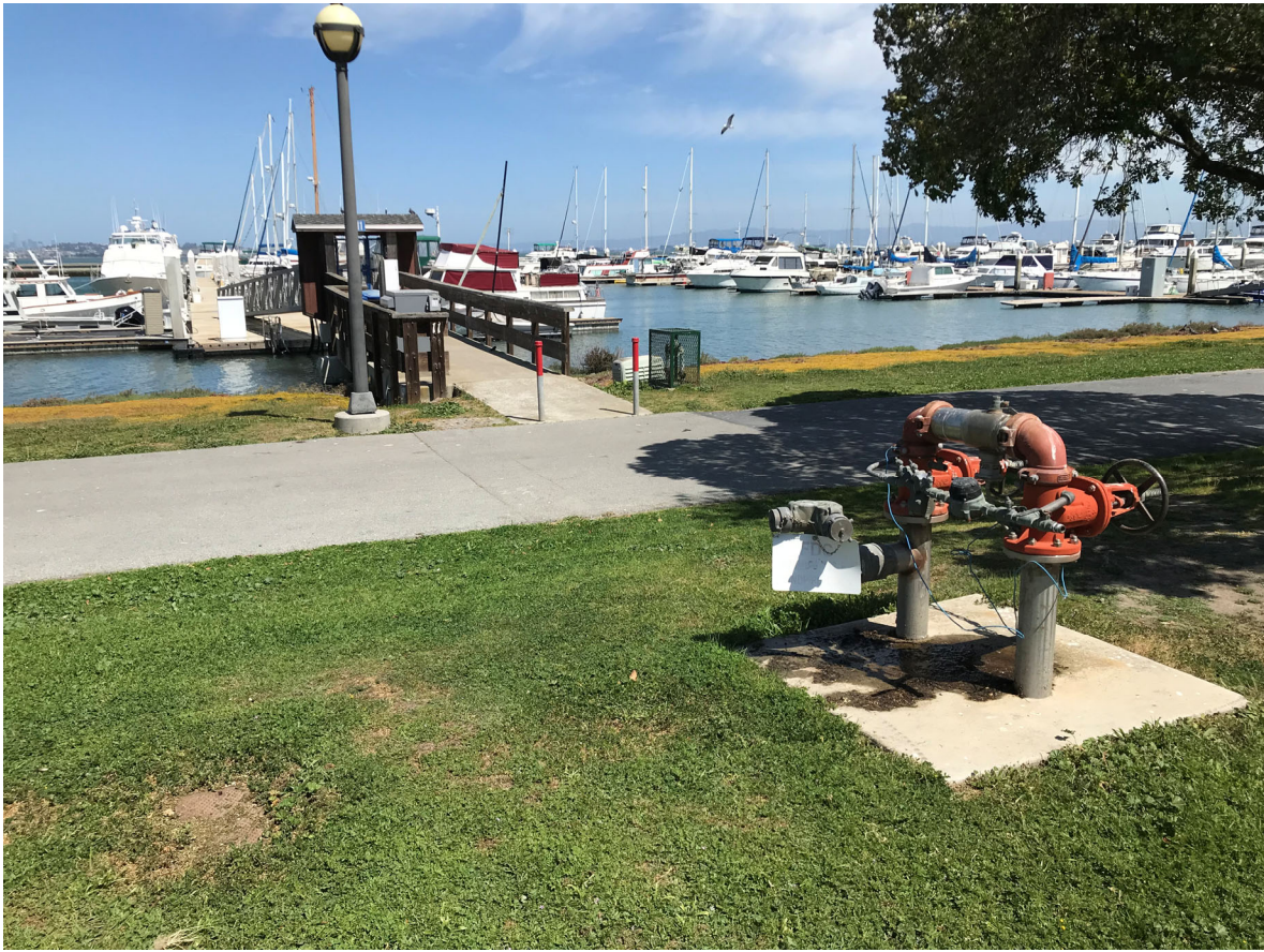
74 – View of Dock 11 fire department connection, dock entrance and Bay Trail