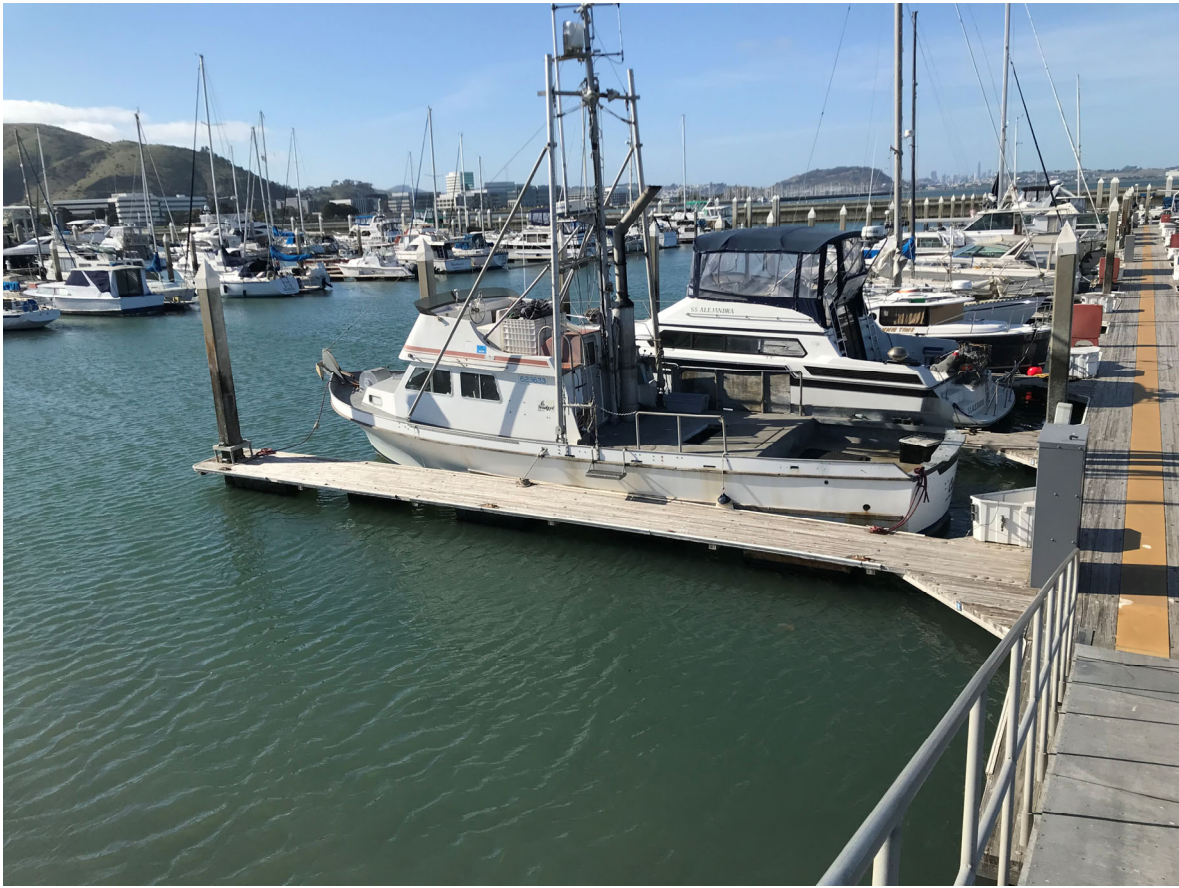
40 – View of East Basin Dock 13