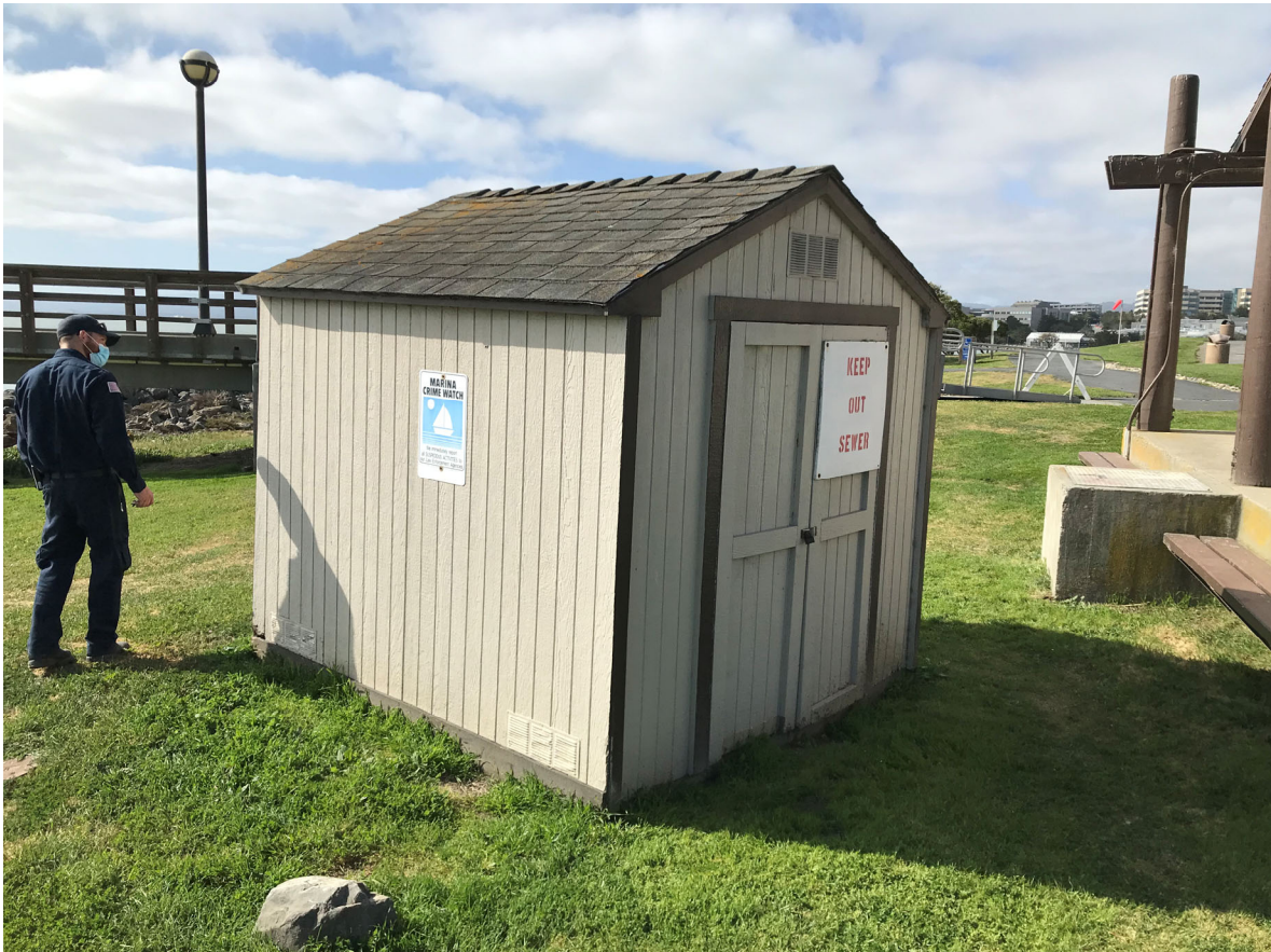
57 – View of small sewer system housing next to Restroom Building 1