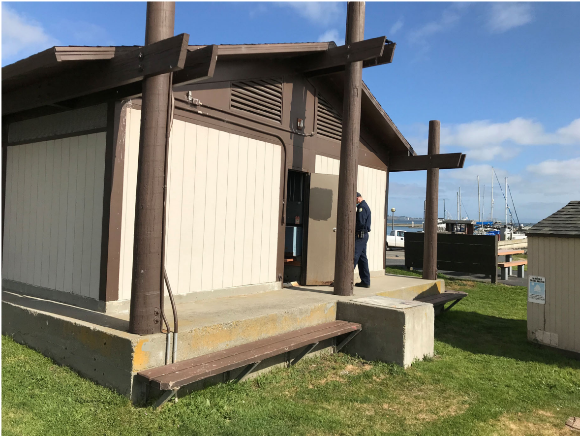
54 – View of Restroom Building 1 adjacent to Public Fishing Pier