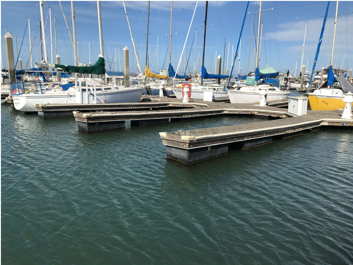
16 – View of West Basin Dock 4 fingers uplifted at ends