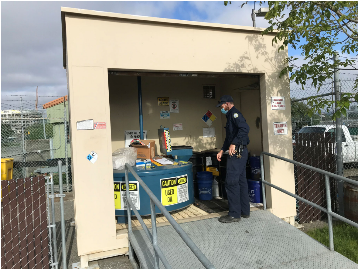
64 – View of oil recycling next to Maintenance Building