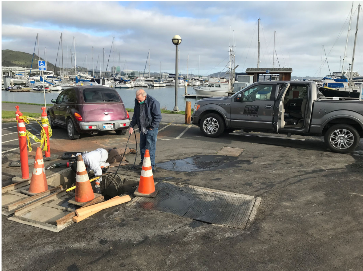
77 – View of electrical vault near Dock 13 being maintained