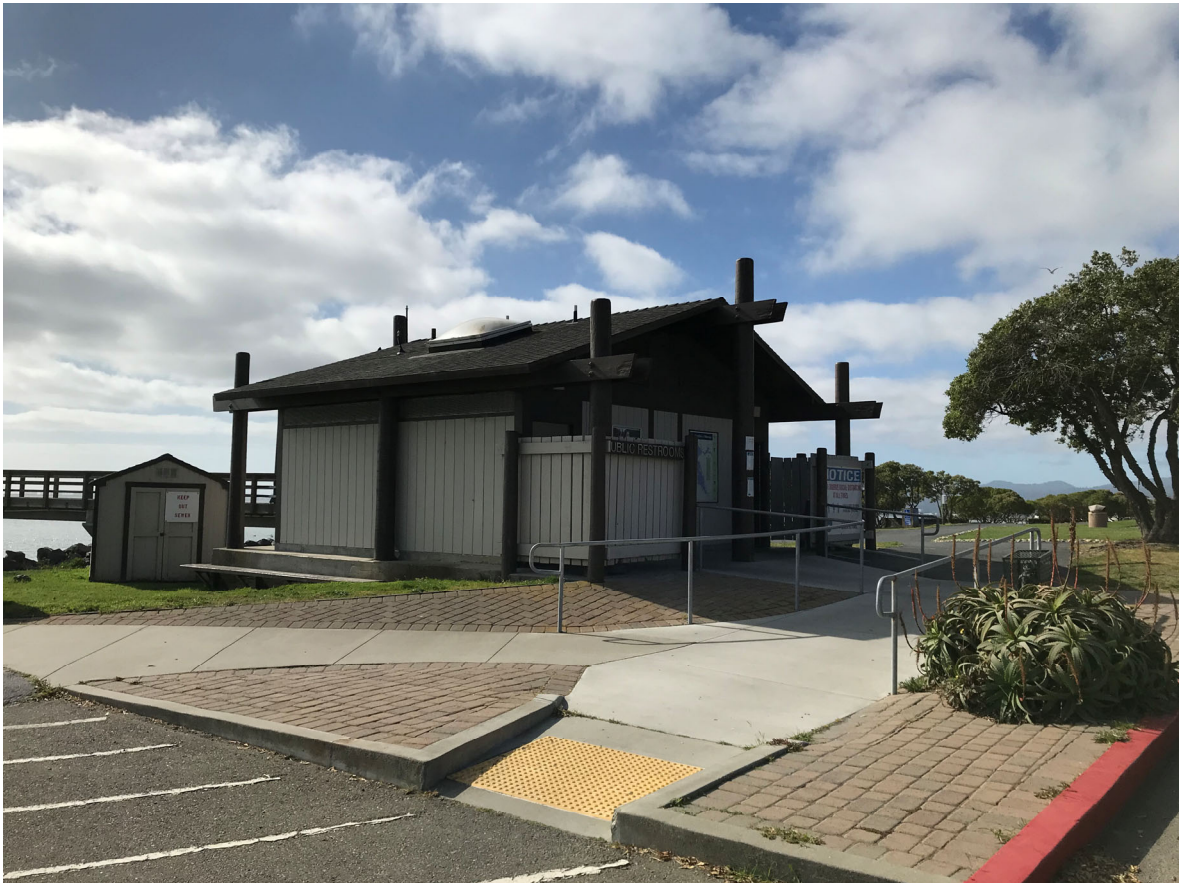
55 – View of Restroom Building 1 adjacent to Public Fishing Pier