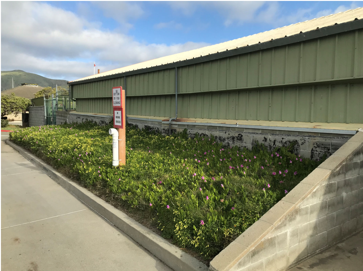
51 – View of south face of Maintenance Building