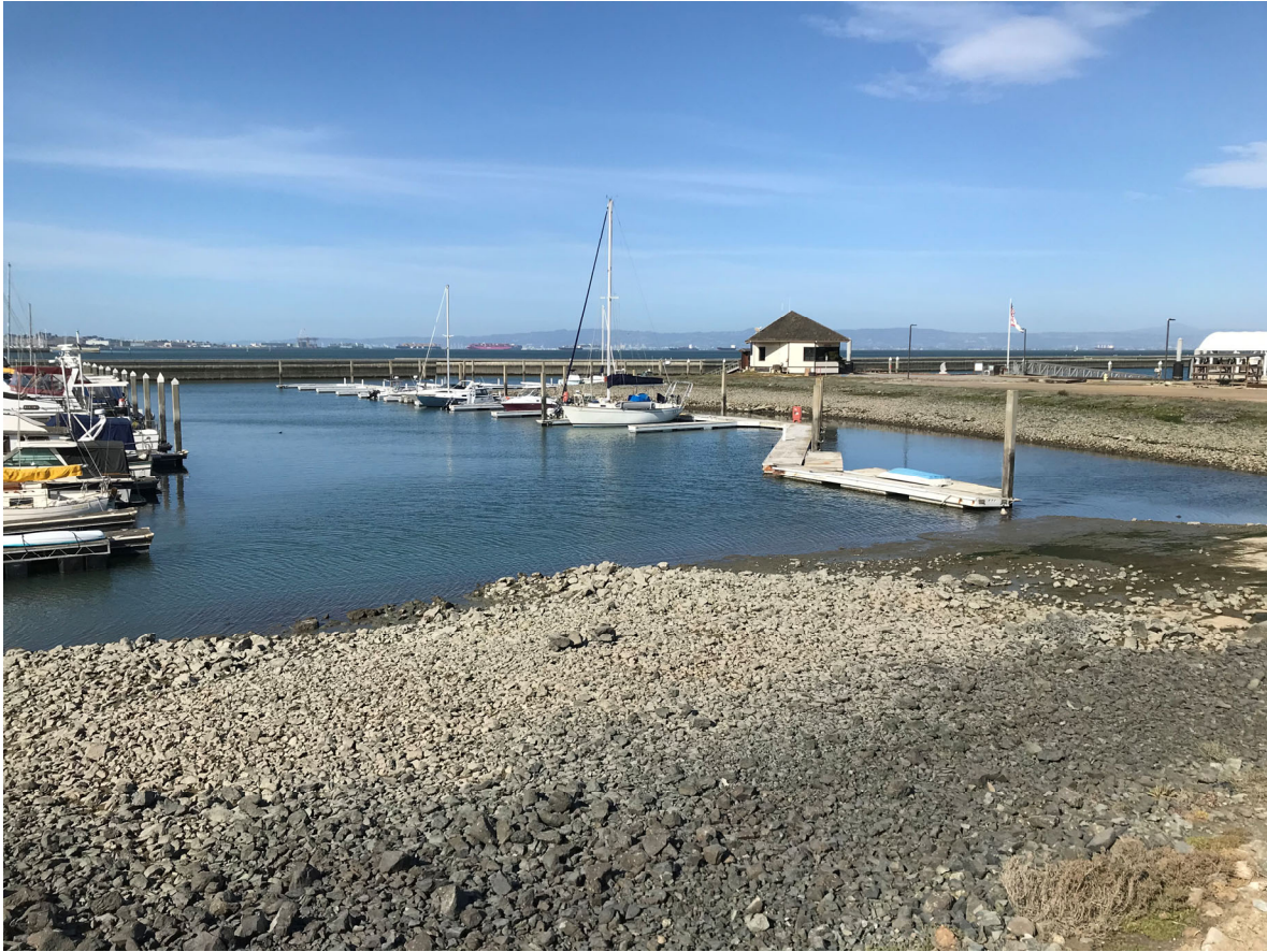
24 – View of West Basin Dock 7 and Harbormaster Building spit