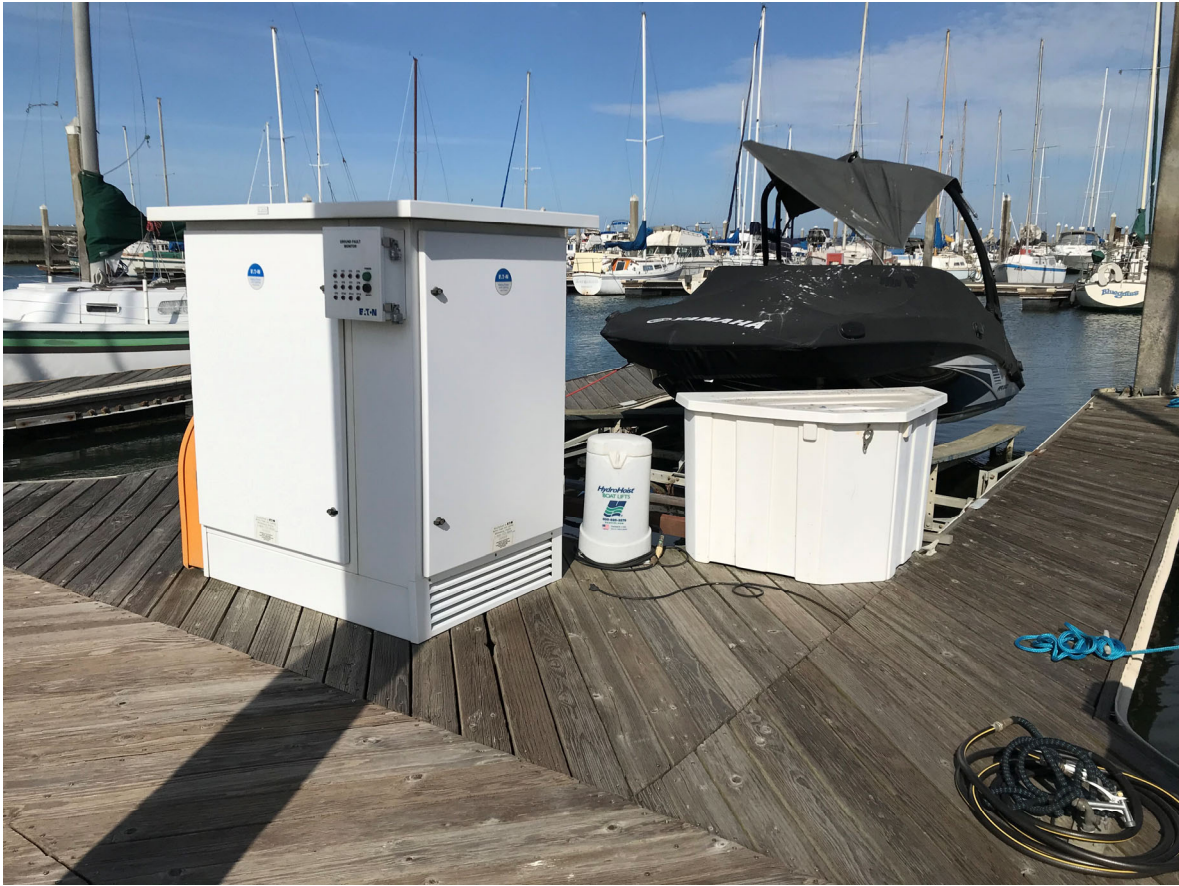
12 – View of Dock 3 electrical transformer