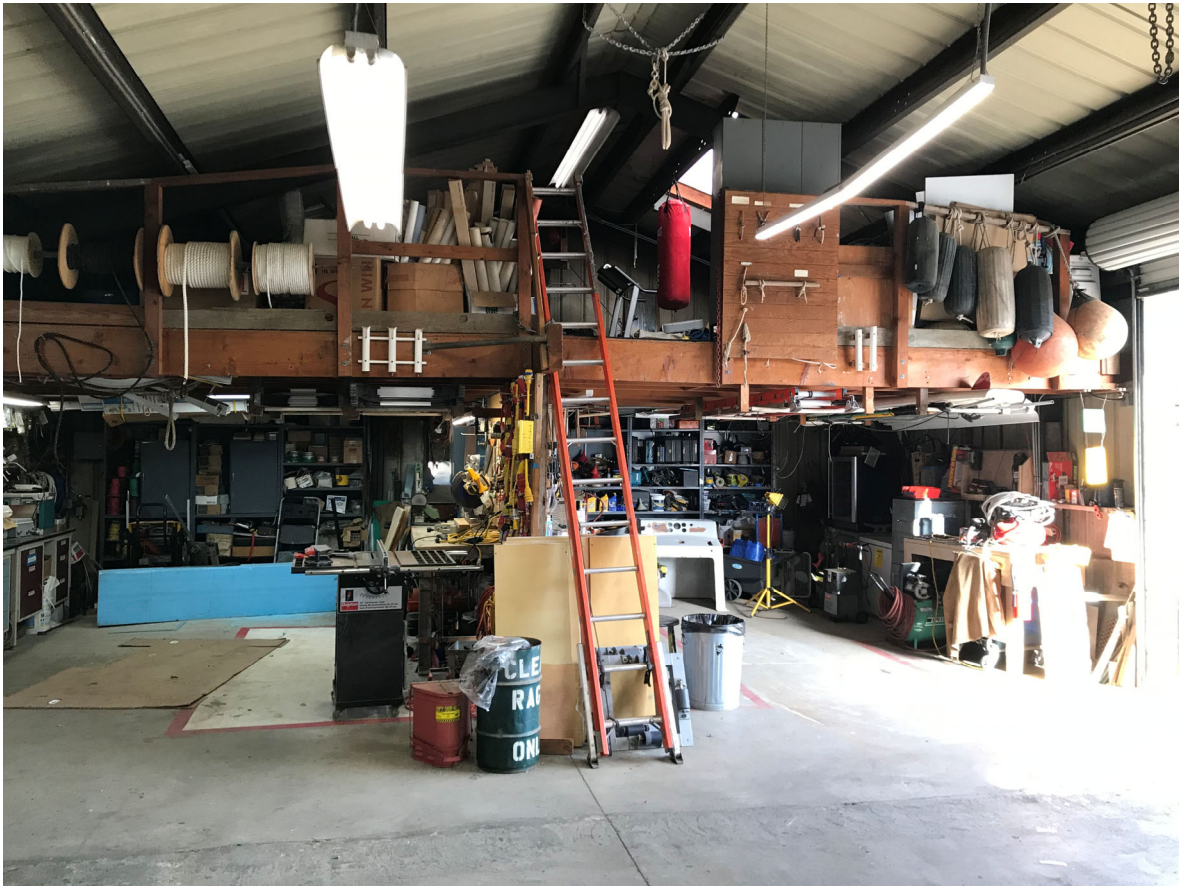
52 – View of interior of Maintenance Building