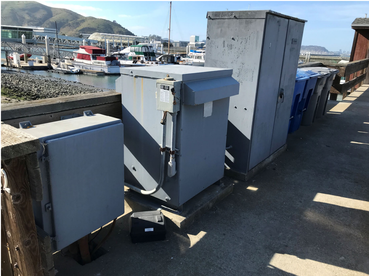
35 – View of East Basin Dock 12 gangway platform electrical distribution panels