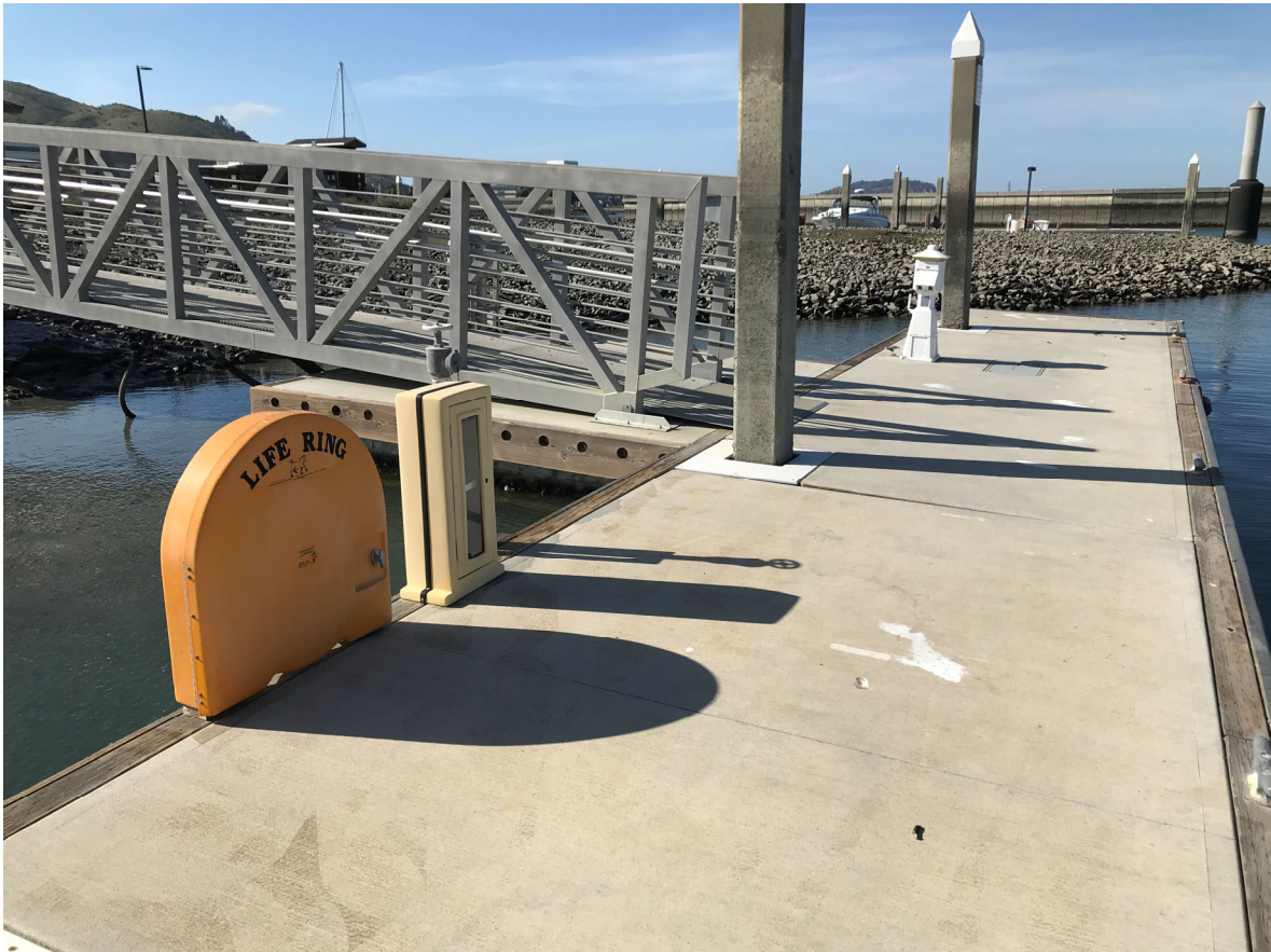
27 – View of Guest Dock