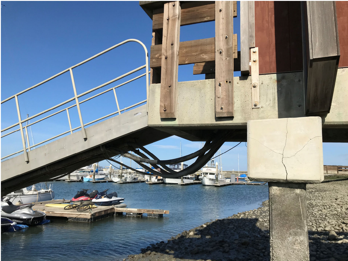
33 – View of Dock 12 gangway platform concrete bent cracks