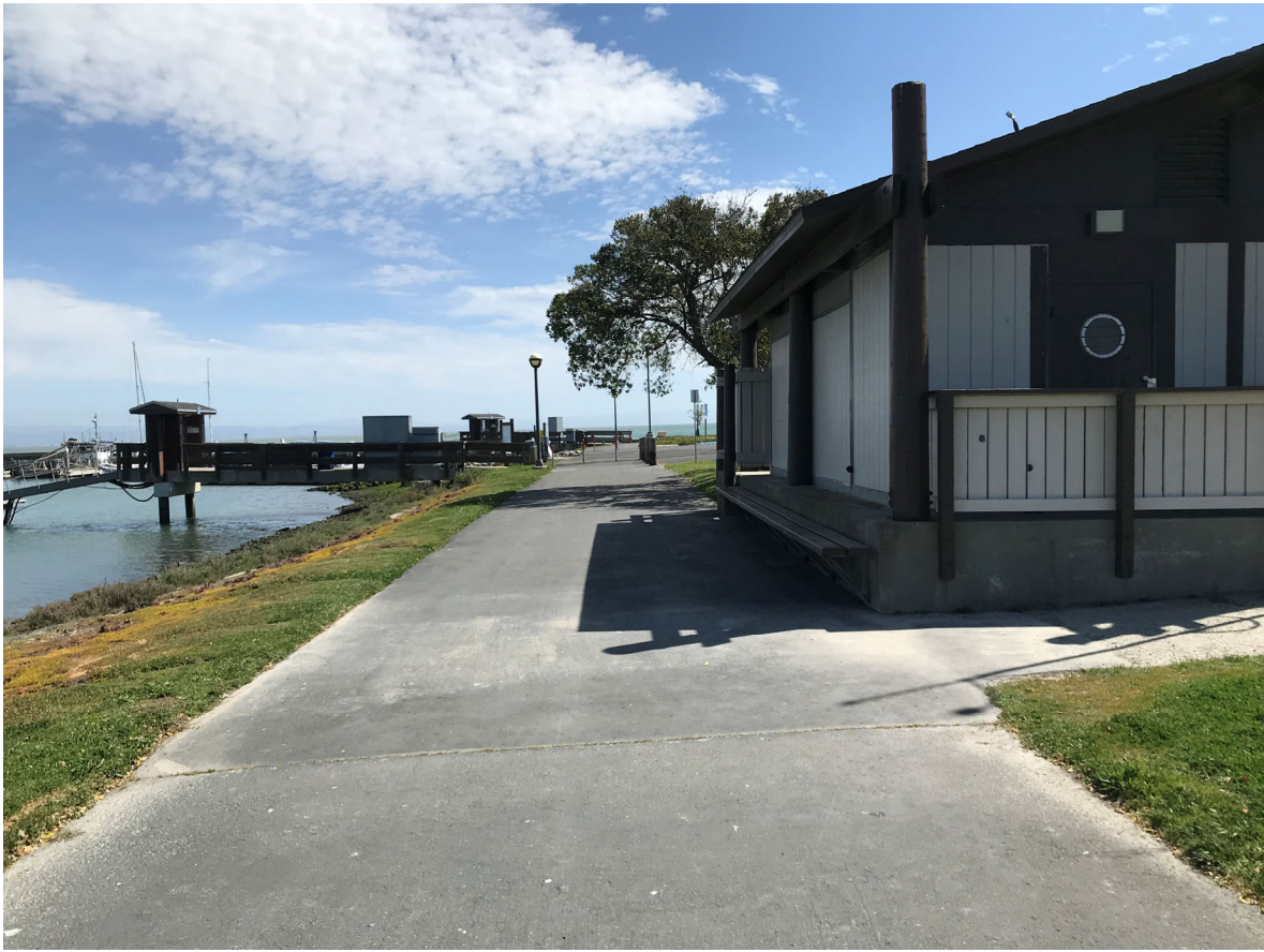
68 – View of San Francisco Bay Trail adjacent to Dock 12