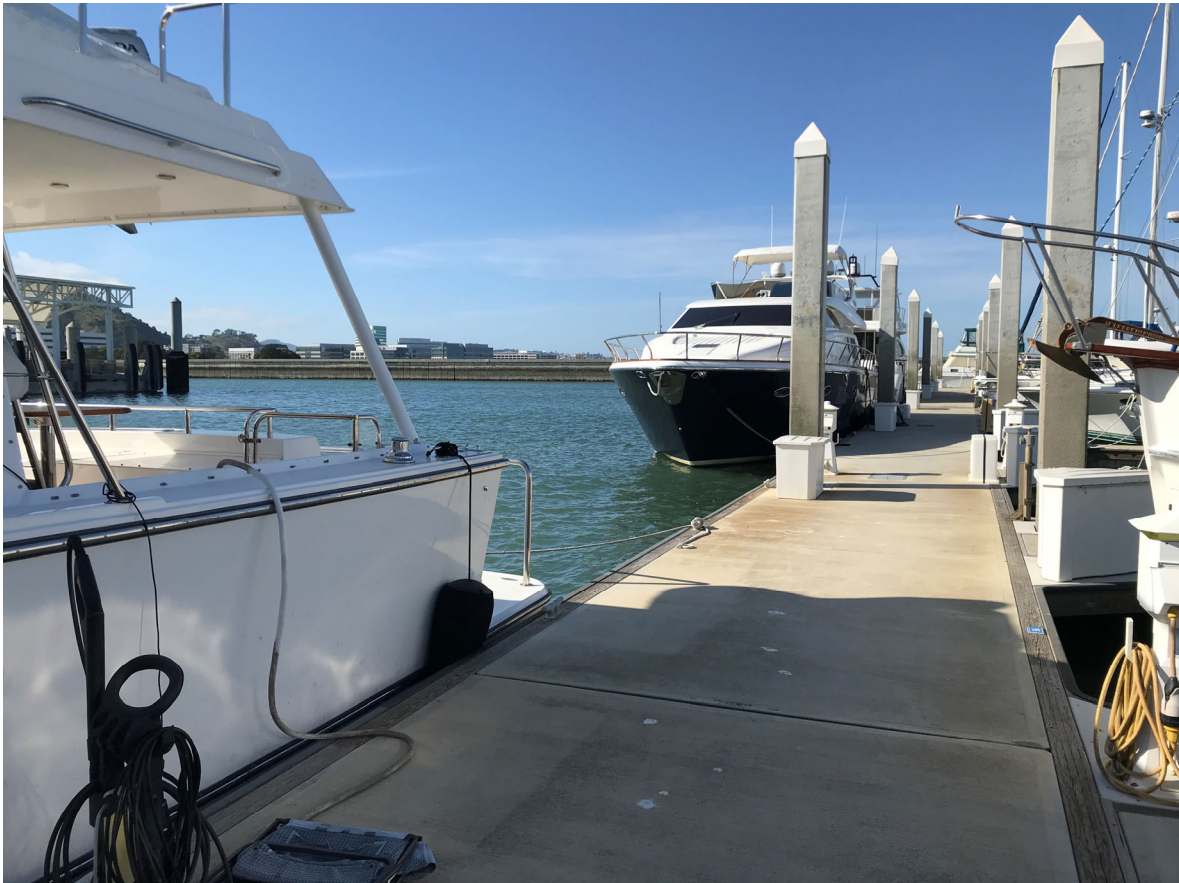
31 – View of sidetie along Dock 11