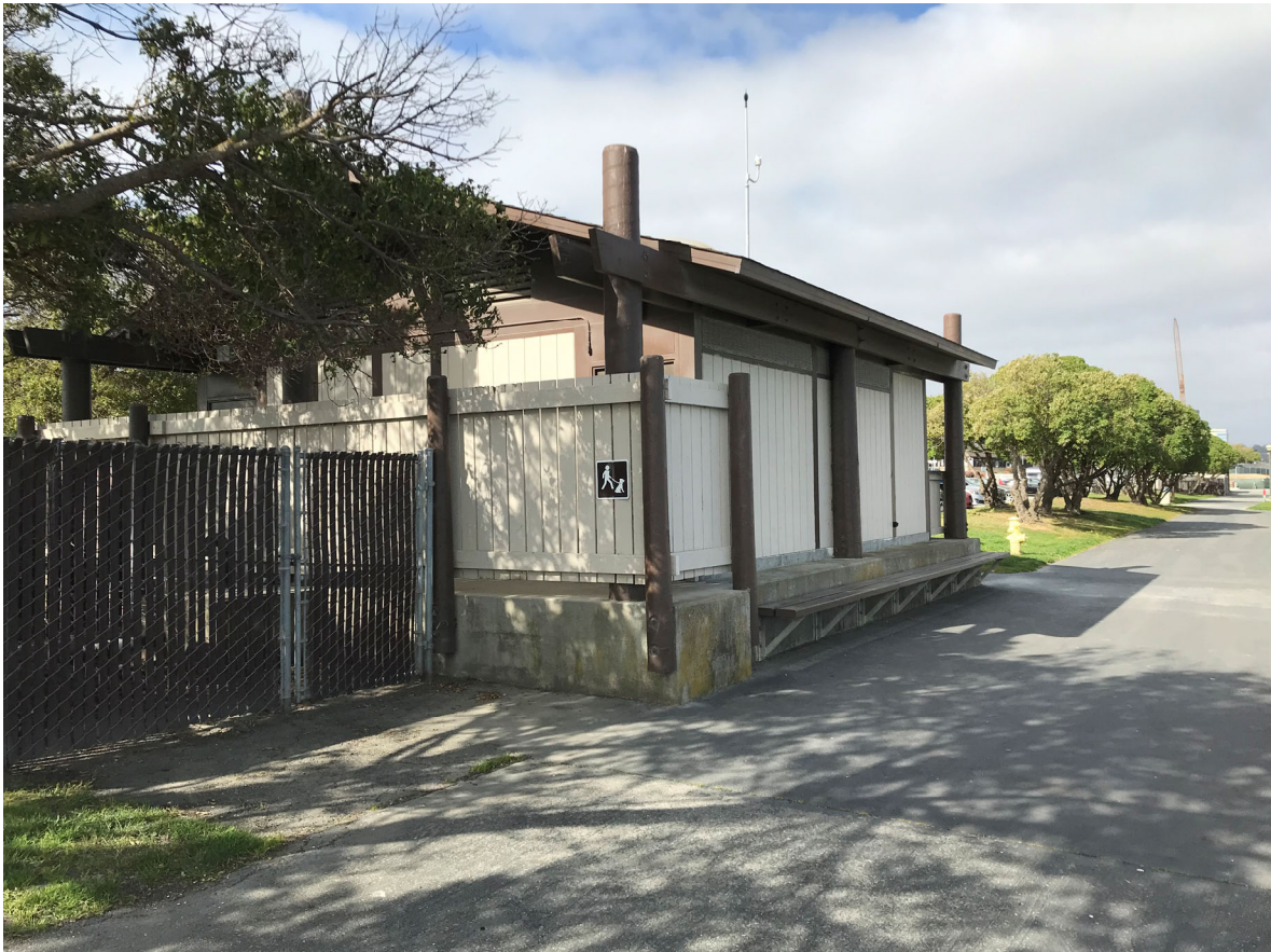
59 – View of East Basin Restroom 2 near Docks 12 and 13