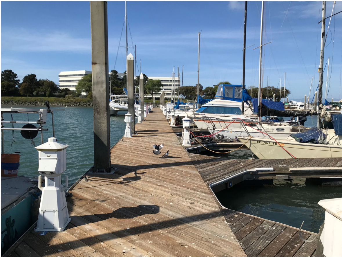
4 – View of West Basin Dock 1