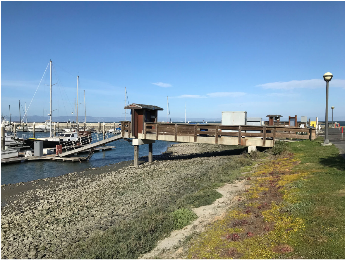
38 – View of East Basin Dock 13 gangway platform