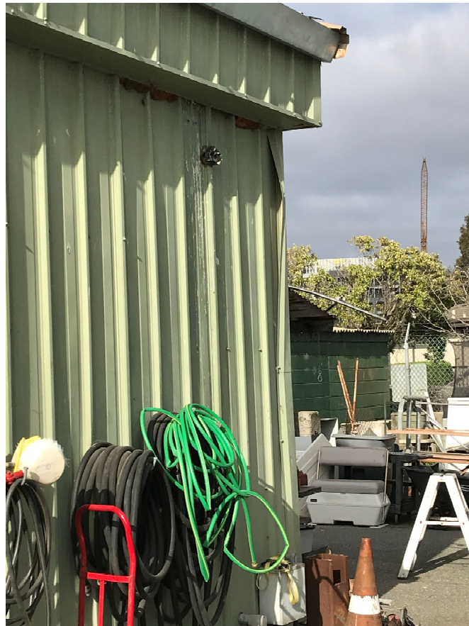
53 – View of warped northwest corner of Maintenance Building