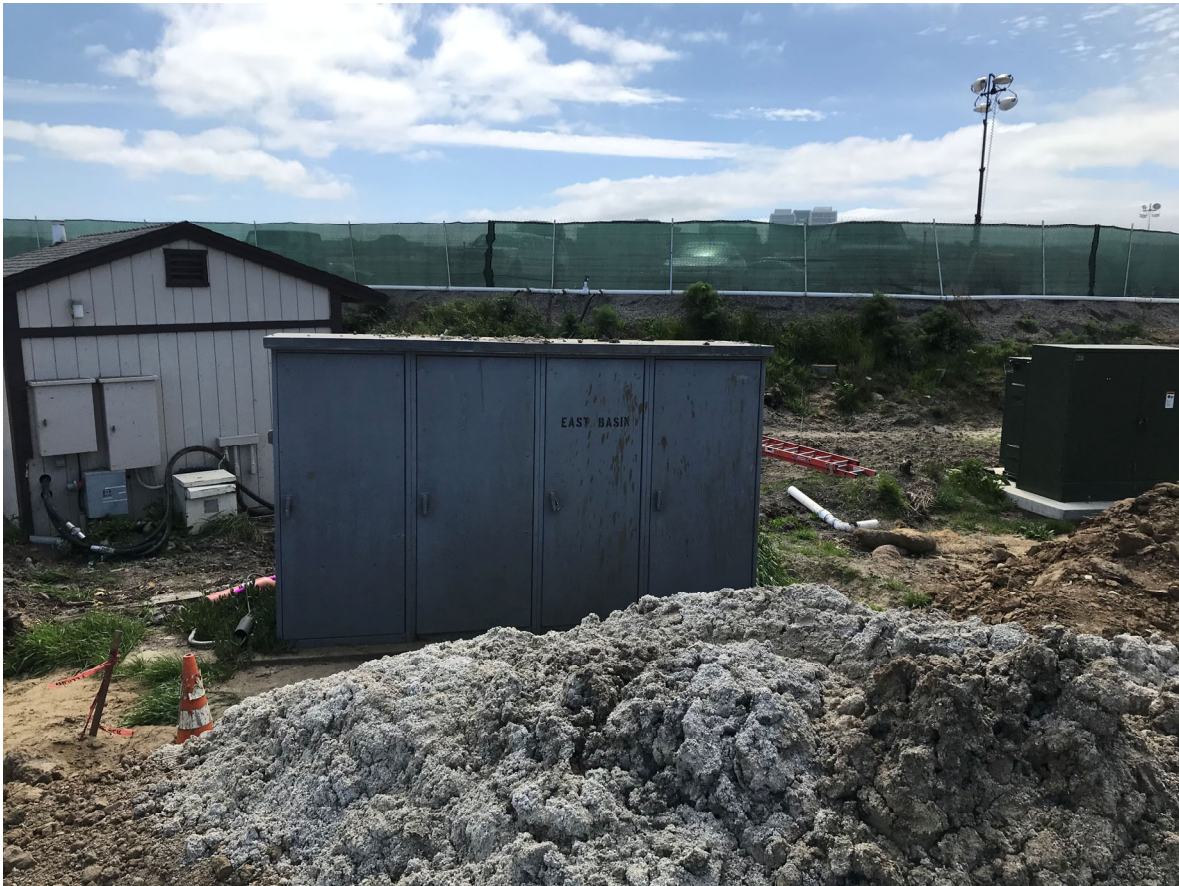
72 – View of Edison and Marina electrical distribution enclosures next to Vacuum Building