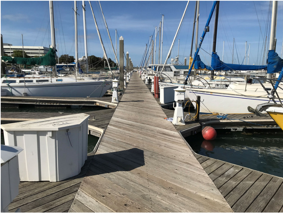
14 – View of West Basin Dock 4