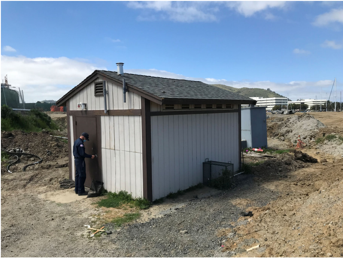
70 – View of Sewer Vacuum and Ejection Building (lift station) and surrounding new site grading