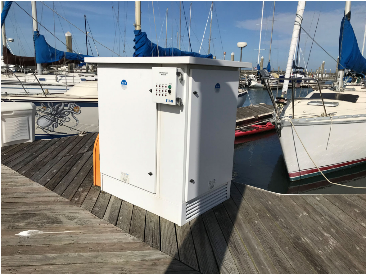
21 – View of West Basin Dock 5 electrical transformer