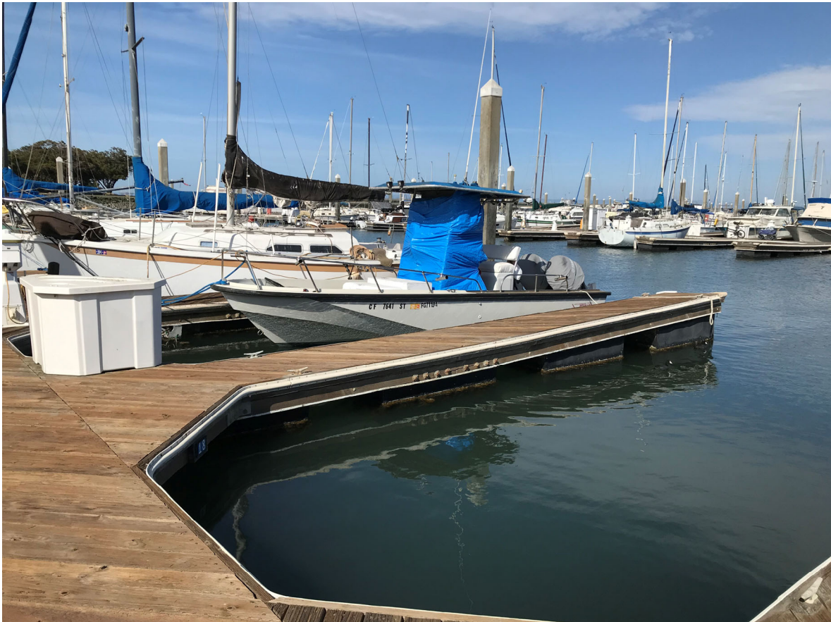
9 – View of uplifting West Basin Dock 2 finger