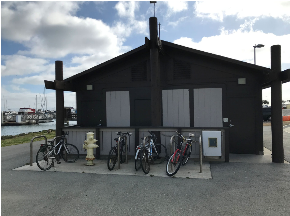
61 – View of East Basin Restroom 3