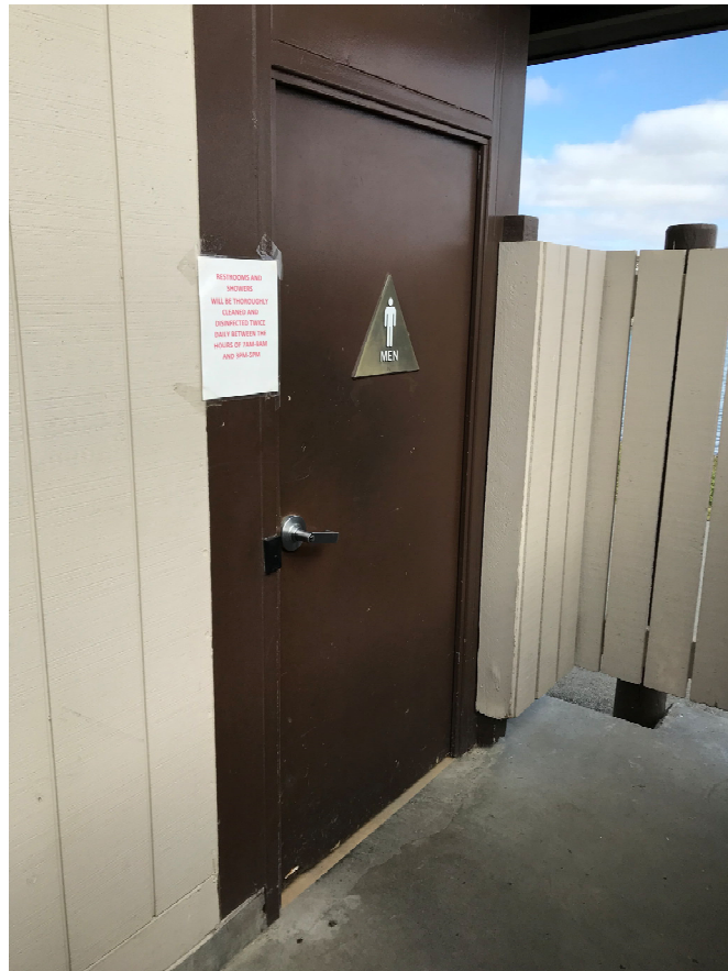
63 – View of East Basin Restroom 3 exterior door and paint