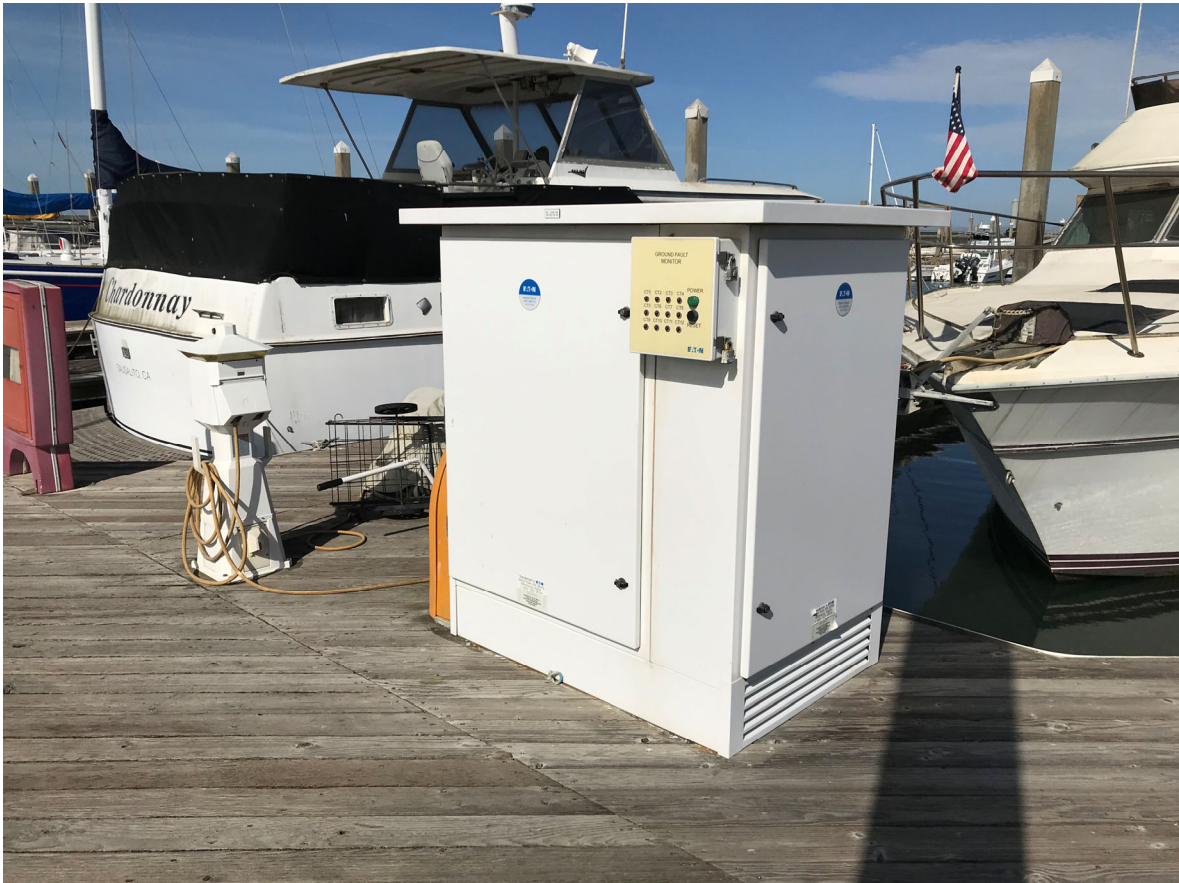
23 – View of West Basin Dock 6 electrical transformer and pedestal