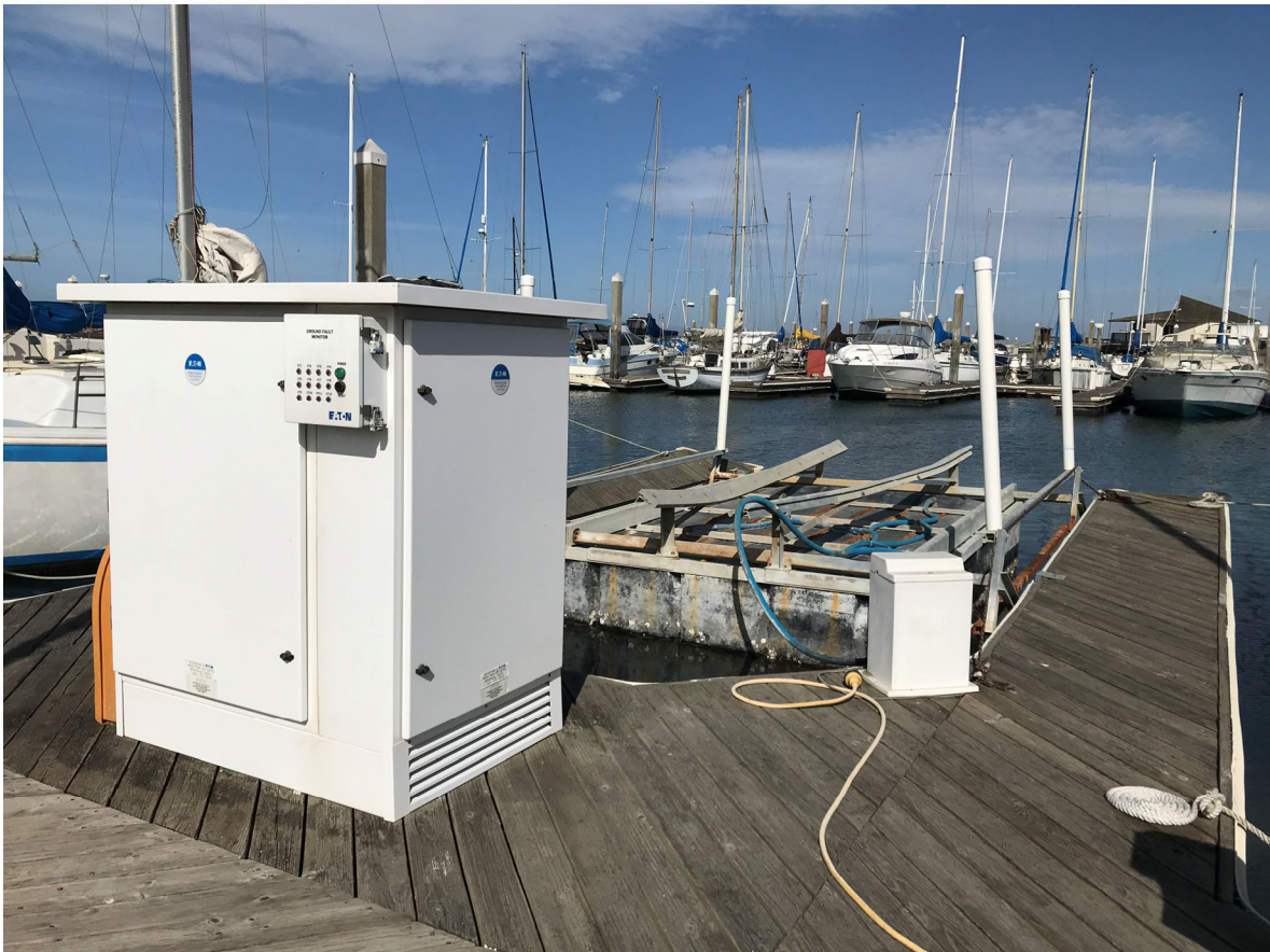
15 – View of Dock 4 electrical transformer and finger