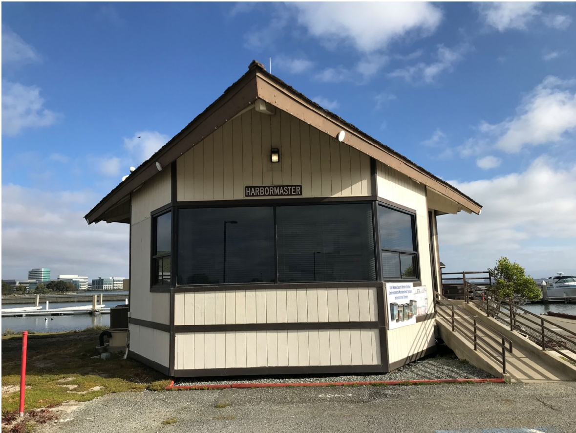
48 – View of Harbormaster's Office Building