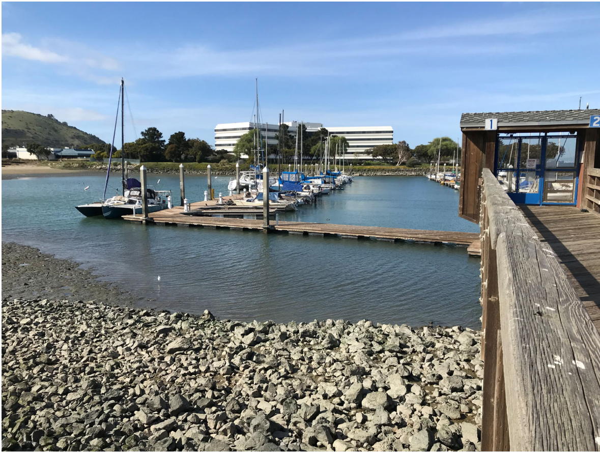
2 – View of West Basin Dock 1