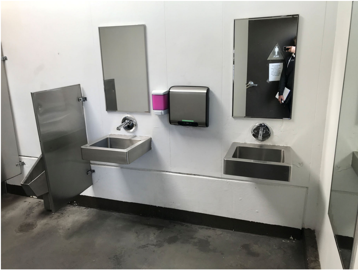
56 – View of Restroom Building 1 interior