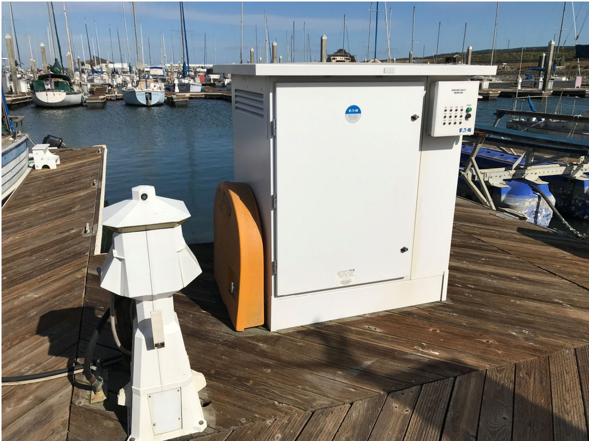
5 – View of Dock 1 finger and utilities