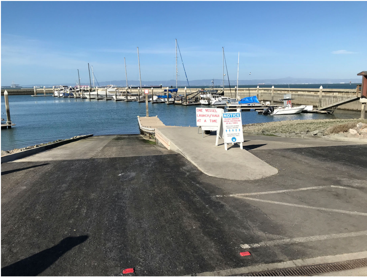
78 – View of Boat Launch Ramp and worn asphalt apron surface