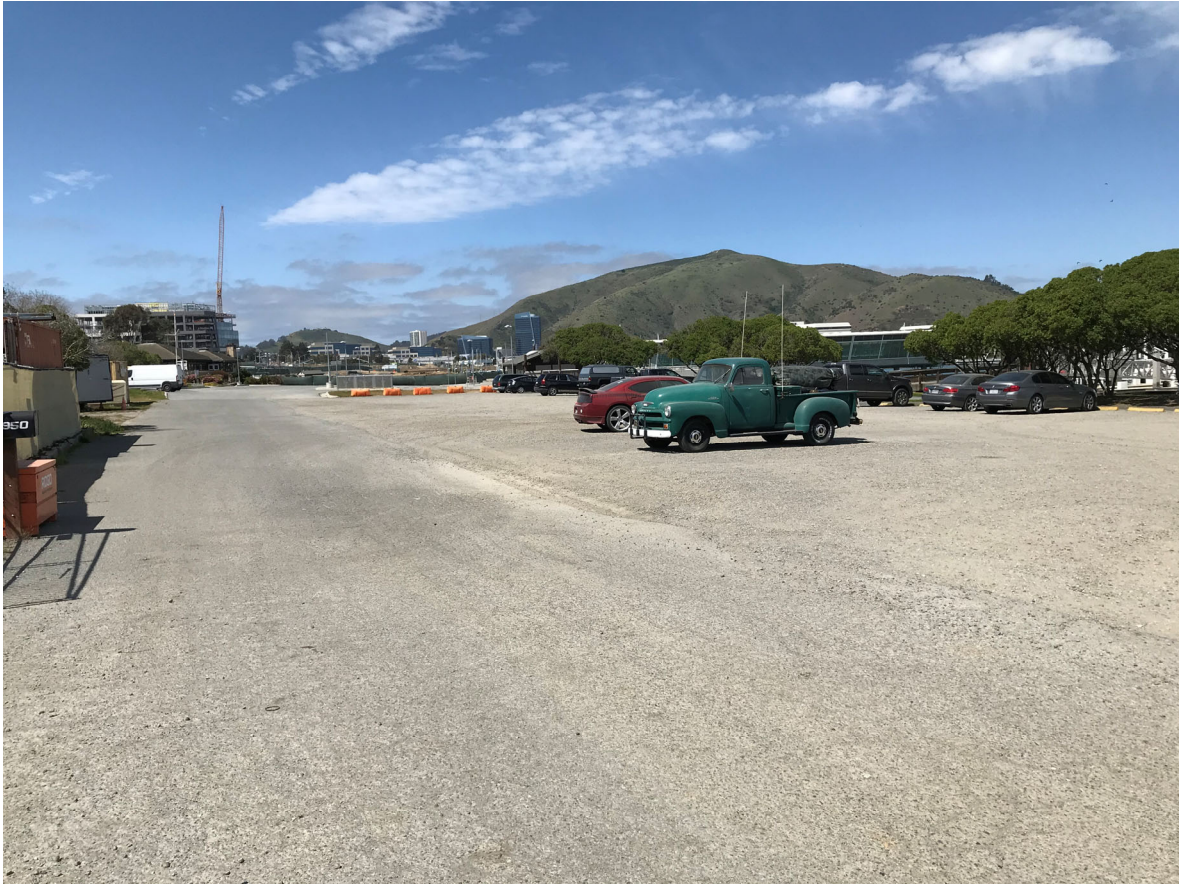
66 – View of Lower Parking lot gravel and degraded asphalt surfaces