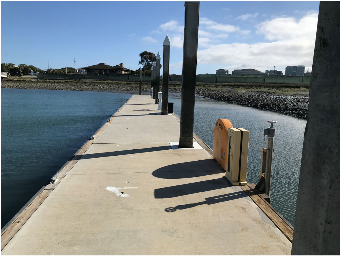
26 – View of Guest Dock