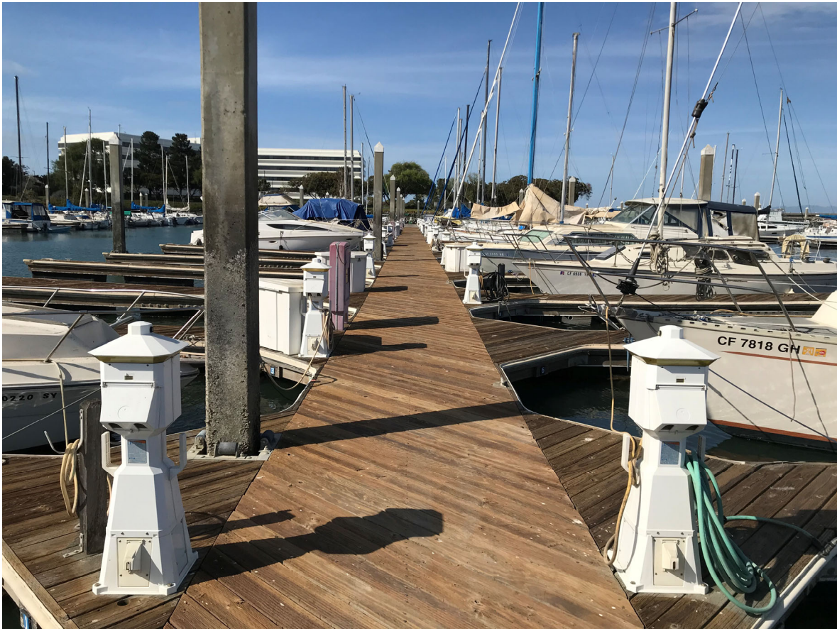
6 – View of West Basin Dock 2