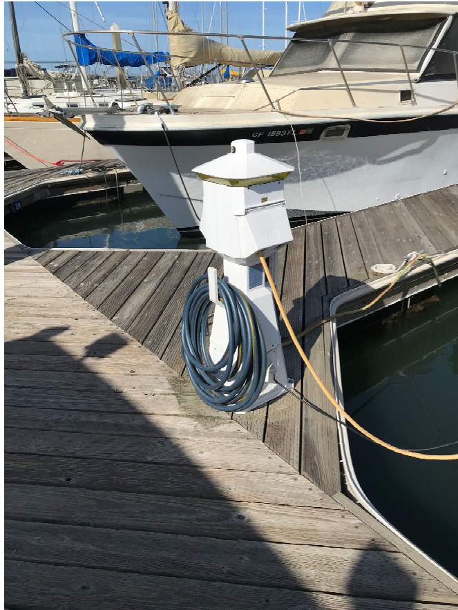
19 – View of Dock 5 utility pedestal