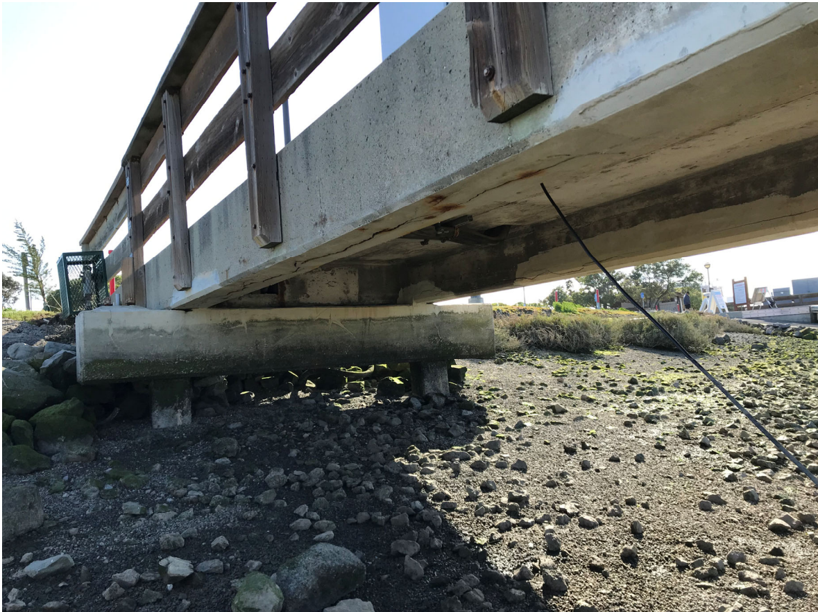
45 – View of East Basin dock 14 gangway platform cracked concrete beams