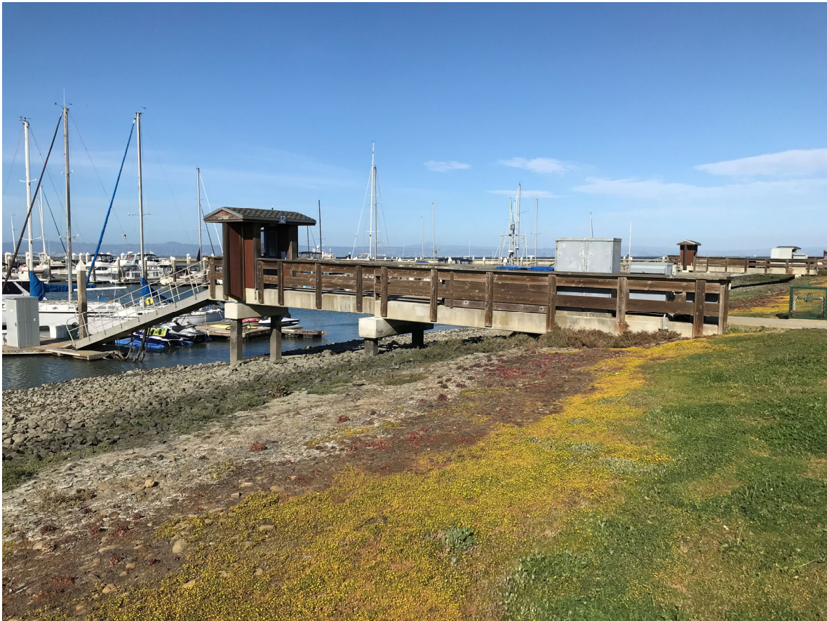
32 – View of Dock 12 gangway platform