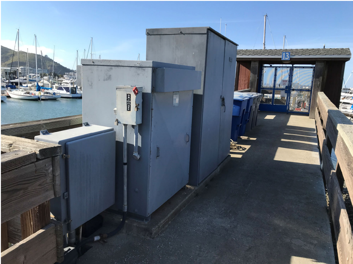
39 – View of East Basin Dock 13 electrical panels on gangway platform