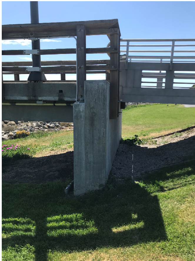
81 – View of Fishing Pier abutment