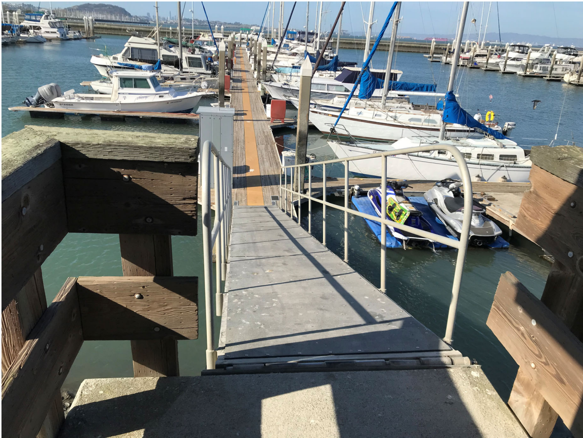
36 – View of East Basin Dock 12