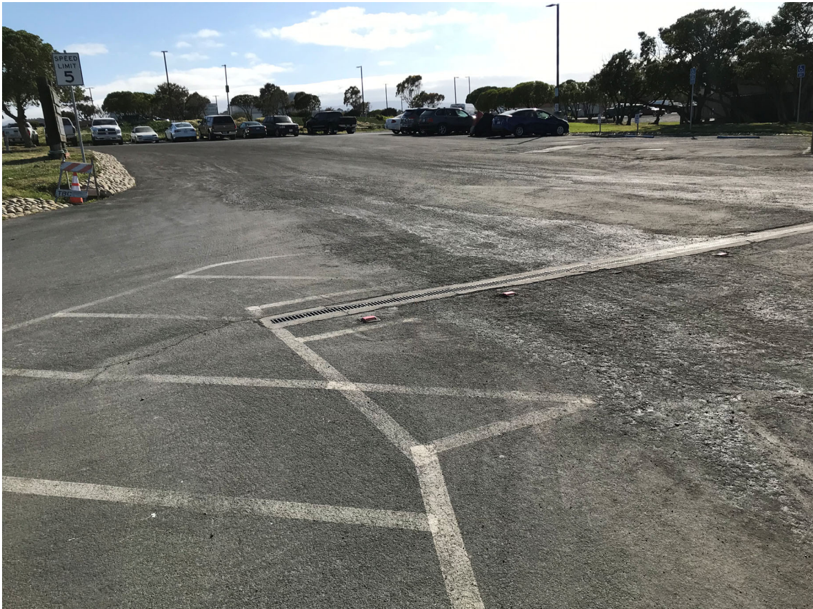
79 – View from top of Boat Launch Ramp of worn asphalt apron and roadway surface to parking area