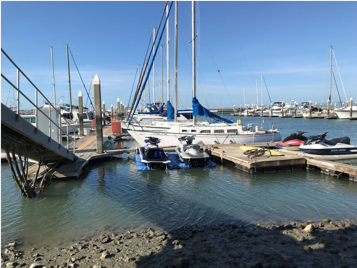
34 – View of East Basin Dock 12