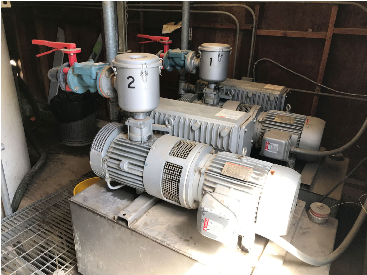
71 – View of Vacuum Building interior