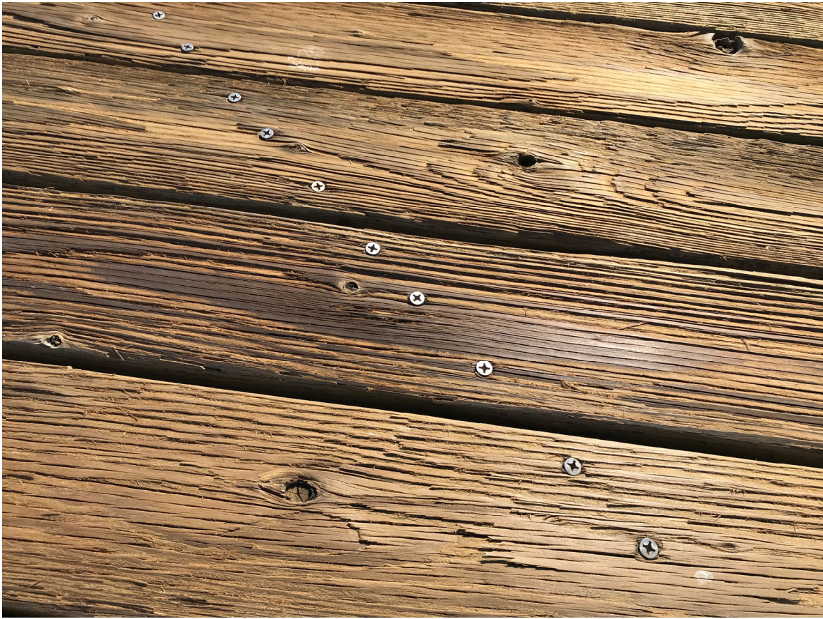
8 – View of stainless steel deck screw on Dock 2