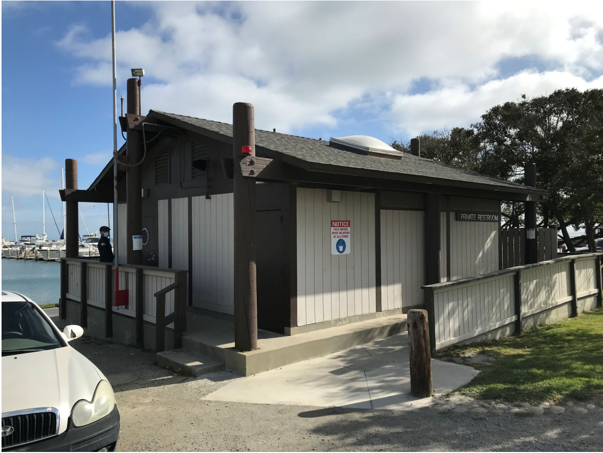
58 – View of East Basin Restroom 2 near Docks 12 and 13