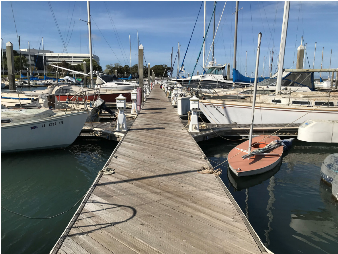
11 – View of West Basin Dock 3