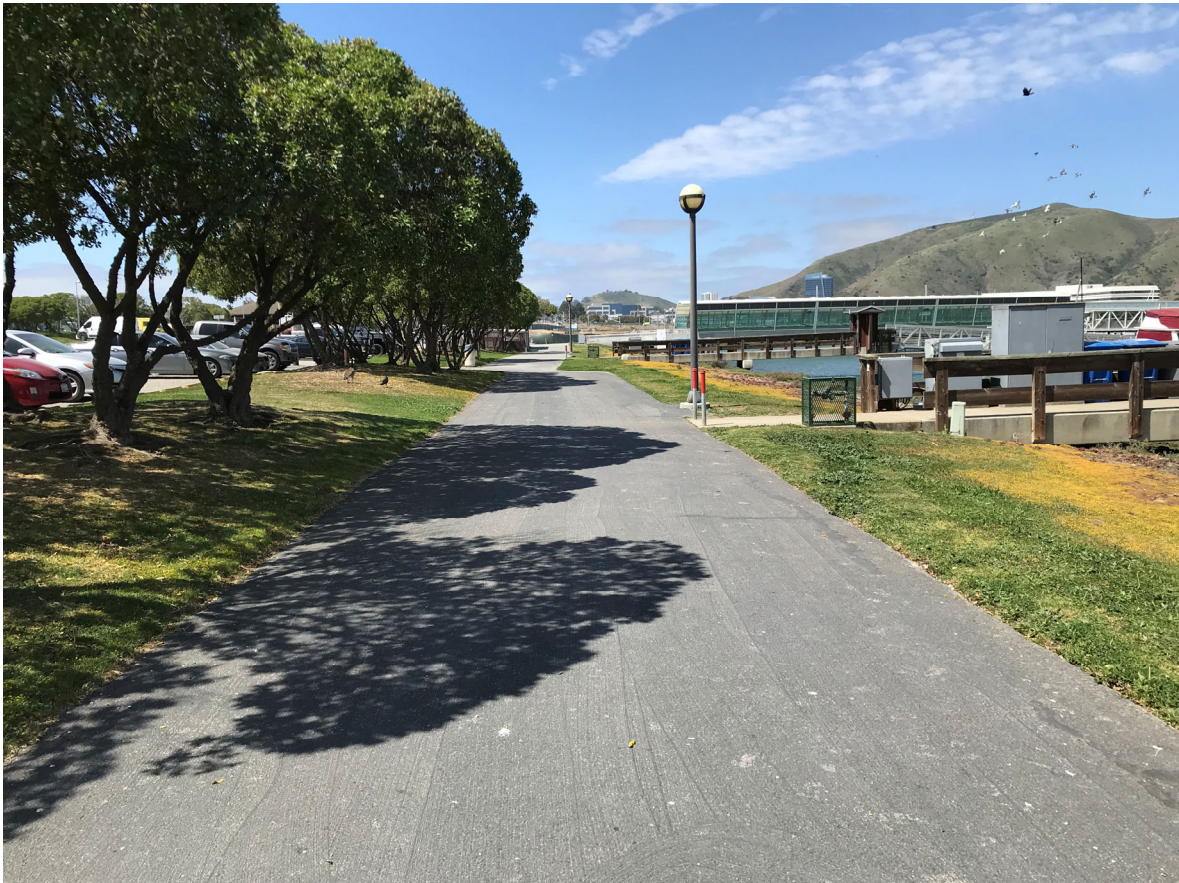
69 – View of San Francisco Bay Trail adjacent to Dock 12