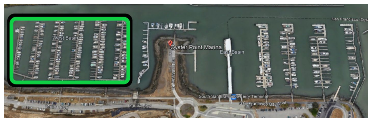
Docks 1 through 6 Oyster Point Marina East Basin

Issue: The District did not anticipate at the signing of the 2018 Agreement that the cost for dock replacement and dredging would increase by such a significant amount. Thus, the District has not budgeted for, nor does the District have, the $12 to $14 million to complete the project.