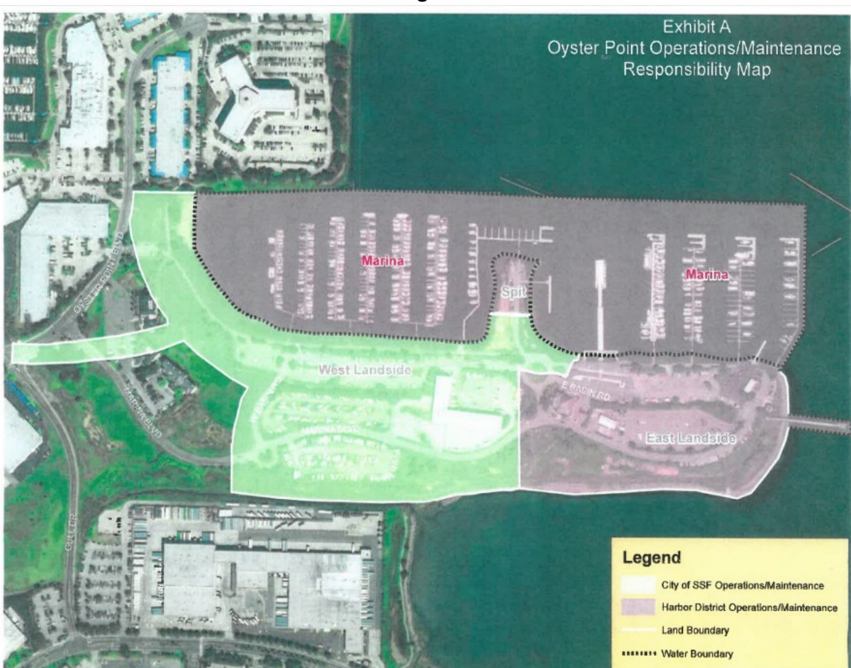
Exhibit A 2018 Agreement

<u>Section 4.C.iii of the 2018 Agreement</u>, the "Parties agree to meet and confer if circumstances unforeseen at the time of the Effective Date compel the replacement of capital infrastructure such that it would be unreasonable for the District to bear the sole cost of replacement."