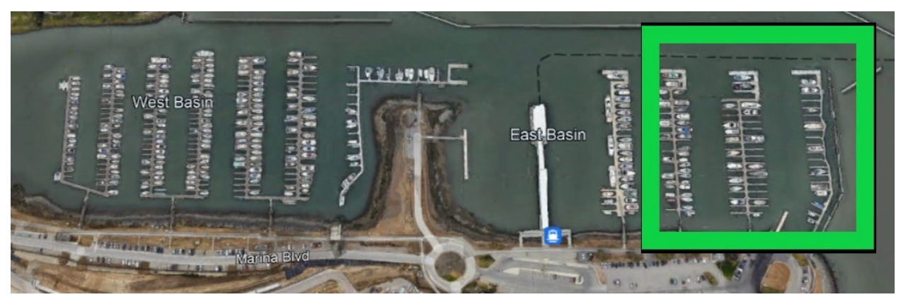
Docks 12, 13, and 14 Oyster Point Marina East Basin

Issue : Section 4.A.iii of the 2018 Agreement, the City and Harbor District estimated the project cost to be less than $5 million. However, estimated costs are now projected to be $6,701,317.00. This represents a $1,701,317 funding shortfall.