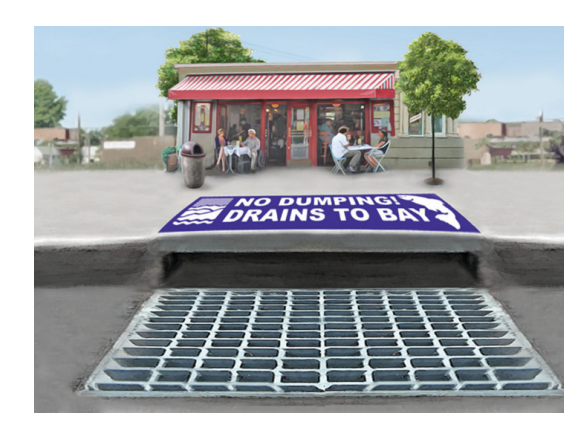
Storm Drain: An outdoor drain that flows directly to creeks, the Bay and Ocean.

The pollution prevention practices outlined in this booklet will help your business stay in compliance with laws designed to protect stormwater and the environment. The Pollution Prevention Program's friendly and knowledgeable staff make it easy for businesses to understand the water pollution regulations that affect them. If you have questions, contact your local stormwater agency (See Local Regulatory Contacts, page 7).