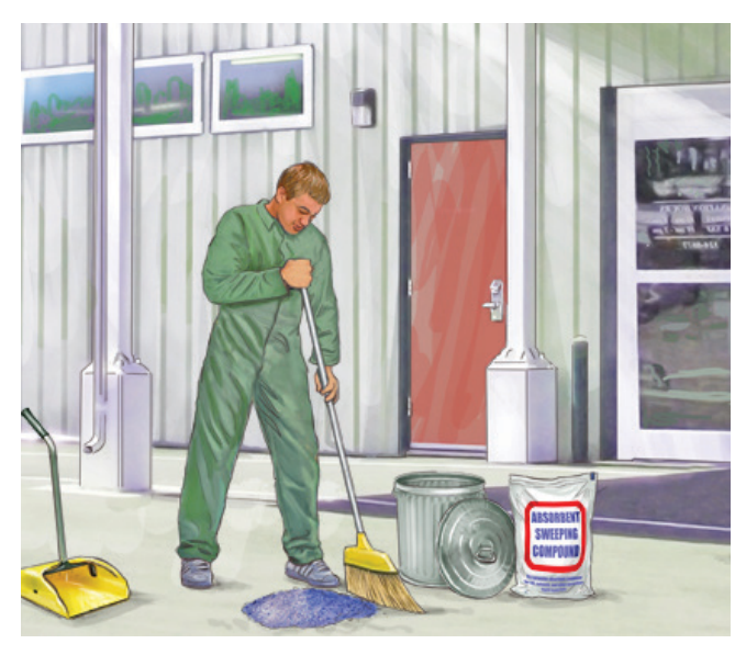
* Absorbent that was used on a small spill is being swept up for disposal. Used absorbents may be hazardous waste and must be disposed of properly.

Perform work indoors or under cover whenever possible, to avoid exposure to rainfall, runoff, and wind. If outdoor work generates small particles or dust, the particles must be contained and vacuumed.