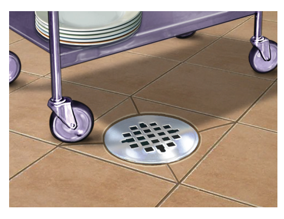
Sanitary Sewer Drain: An indoor drain that flows to the sewage treatment plant.